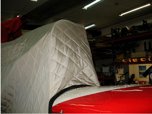
Alouette III Insulated Engine/Transmission Cover

WINTER USE MATERIAL - Made with Solution-Dyed Polyester fabric, this option is intended for seasonal use to aid in deicing, rain mitigation, or for occasional travel. The material is lighter and more compact, but more susceptible to UV damage and may have a shorter useful life if used continuously outside than the all-year use material.