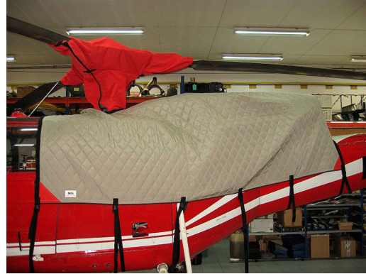
Alouette III Rotor Hub Cover, Insulated Engine/Transmission Cover