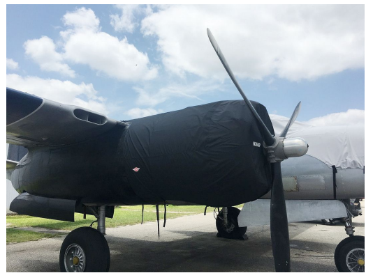
Douglas A-26 Engine Cover