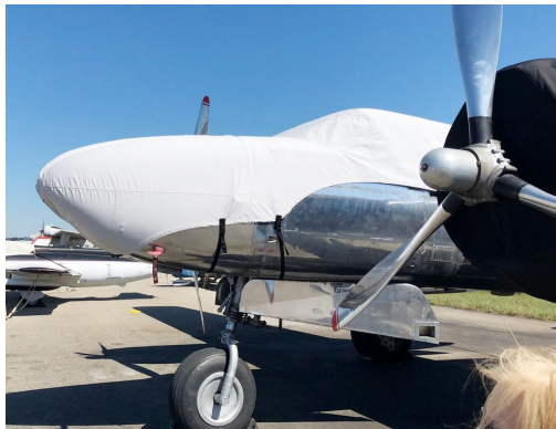
Douglas A26 Invader Cockpit/Nose Cover