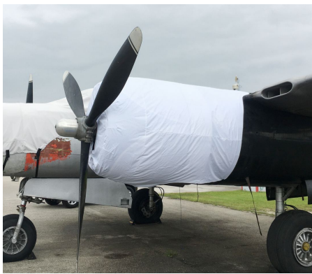
Douglas A-26 Engine Cover, test fit cover