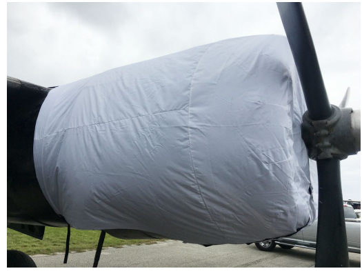
Douglas A-26 Engine Cover, test fit cover