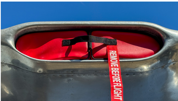
Douglas A26 Invader Oil Cooler Inlet Plugs

Engine Inlet Plugs are custom fit for your Douglas A26 Invader intakes, made with heavy-duty vinyl material, and stuffed with a single block of sculpted urethane foam. Each plug has a zipper that allows the foam to be removed and dried if necessary. Engine plugs have warning flags that are visible from the cockpit or 'remove before flight' streamers sewn onto the face of the plugs. Most plugs are imprinted with the aircraft registration number in black for an extra charge. Storage bag NOT included. Engine plugs may be inserted after flight when the engine is still warm. Engine Inlet Plugs are commonly referred to as Cowl Plugs, Intake Plugs, Cowl Blocks, Engine Blocks, and Engine Bungs.