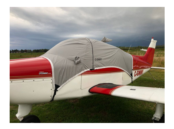
Beech Sundowner Travel Canopy Cover