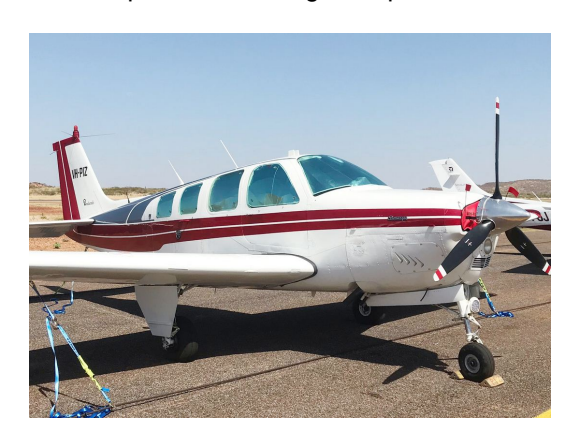
Beech A-36 Bonanza Cabin HeatShields

Windshield Heatshields are interior sunshades for an aircraft's front windshield. The product is a unique composite of closed-cell foam with a silver mylar finish. The semi-rigid design is stiff enough to stand along the inside of the windshield using sun visors or window framing. It folds up flat and easily stores in the included storage sleeve. Some designs may require velcro and suction cups or split right and left sides. A Heatshield is an excellent short-term remedy for cockpit overheating. An external fabric cover is far more effective and practical for long-term protection.