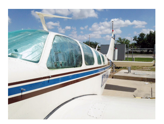
Beech Bonanza HeatShields