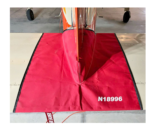
Beech C24R Tailcone Cover, Fully Enclosed

WINTER USE MATERIAL - Made with Solution-Dyed Polyester fabric, this option is intended for seasonal use to aid in deicing, rain mitigation, or for occasional travel. The material is lighter and more compact, but more susceptible to UV damage and may have a shorter useful life if used continuously outside than the all-year use material.