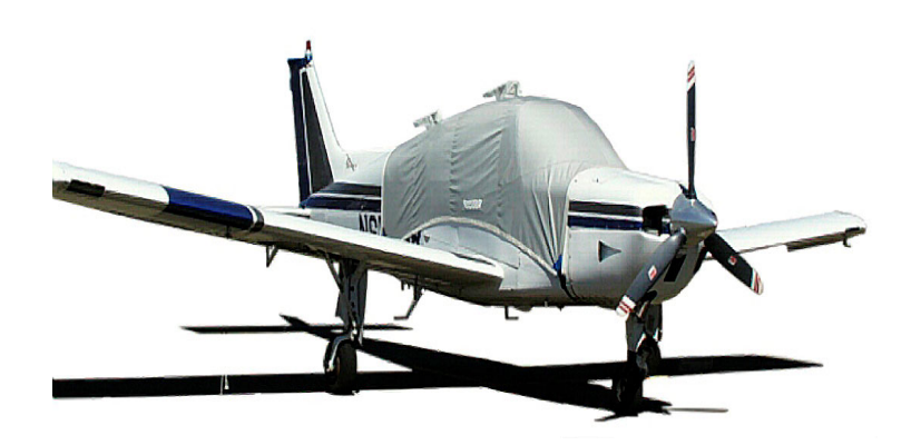
Beech Sport Canopy Cover

Travel Covers are made with Silver Solution-Dyed Polyester fabric and only lined over the windshield to save weight. The material is lightweight and more compact for easy stowage in the aircraft. The polyester material is water resistant, but only intended for occasional use outside. We also have an ultra lightweight material available for fitted hangar dust covers. For daily outdoor use, the non-travel Sunbrella Cover is the best choice.