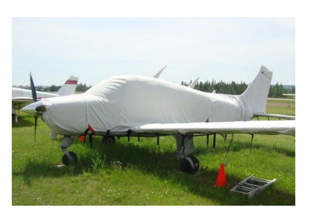
Beech Sierra Engine, Extended Canopy, Empennage, & Wing Covers