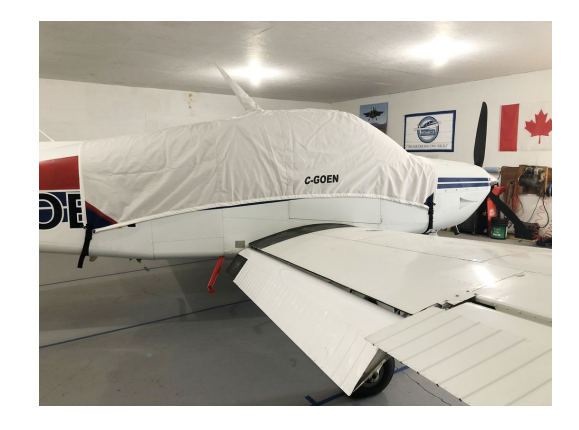
Beech Sierra B24R Canopy Cover

This cover type is made from Silver Acrylic Sunbrella canvas and is 100% lined with a soft and smooth microfiber. Bruce's Custom Covers developed this material combination especially for aircraft protection. The outer material is medium weight and treated for water resistance, UV resistance and anti-static buildup. The inner lining is a very soft and smooth microfiber to prevent scratching. The material is very reflective, and tests show that the cabin interior temperature can be reduced to near-ambient temperature on the hottest of days. It is water, ice and snow repellent, yet breathable to allow moisture to escape from between the cover and the aircraft surface.