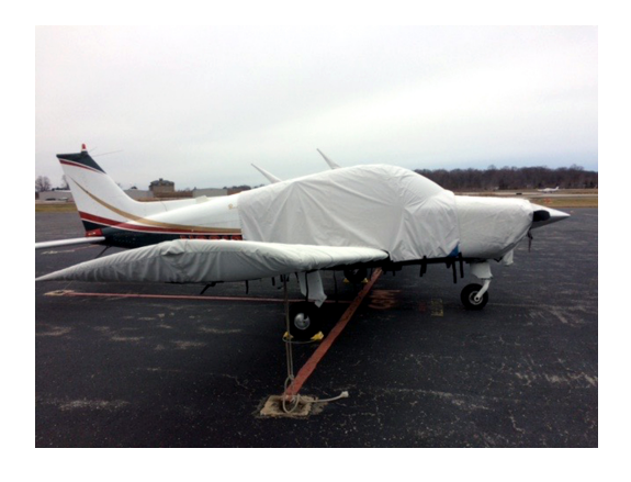
Beech Sundowner Extended Canopy Cover, Engine, and Wing Covers