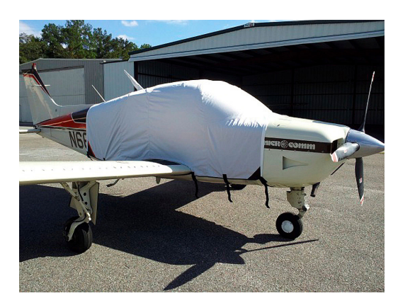
Beech Sport Extended Canopy Cover