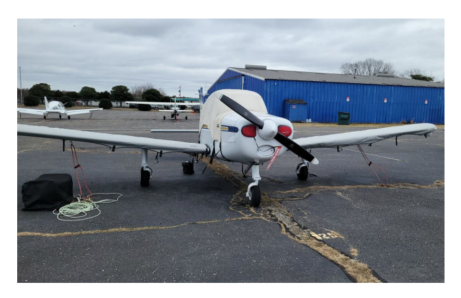
Beech Musketeer A23 Wing Covers

WINTER USE MATERIAL - Made with Solution-Dyed Polyester fabric, this option is intended for seasonal use to aid in deicing, rain mitigation, or for occasional travel. The material is lighter and more compact, but more susceptible to UV damage and may have a shorter useful life if used continuously outside than the all-year use material.