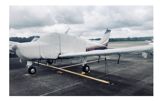
Beech Sundowner Extended Canopy Cover, Fully Enclosed Engine Cover, Wing Covers