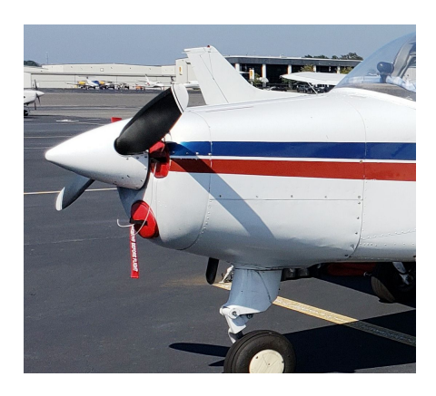
Beech A23 Musketeer Insulated Prop Cover, Engine Plugs