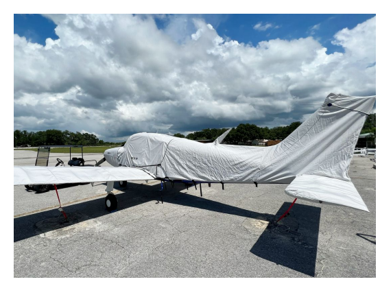
Beech Musketeer A23 Cover Set