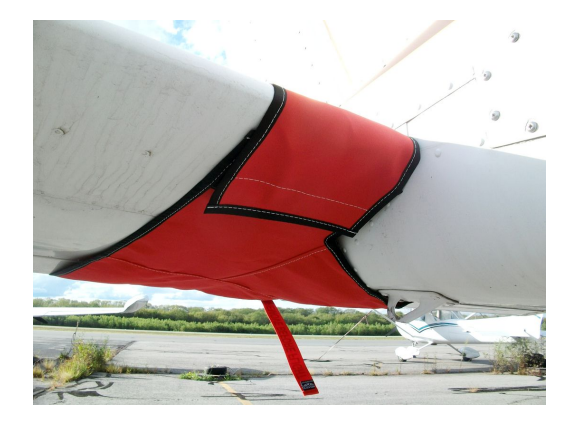
Beech Musketeer Tailcone Cover (Fully Enclosed)