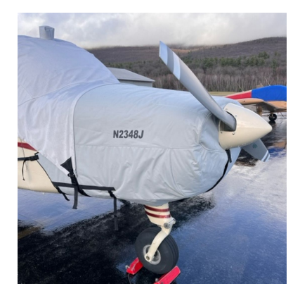
Beech Musketeer Insulated Engine Cover

This cover type is made from Silver Acrylic Sunbrella canvas and is 100% lined with a soft and smooth microfiber. Bruce's Custom Covers developed this material combination especially for aircraft protection. The outer material is medium weight and treated for water resistance, UV resistance and anti-static buildup. The inner lining is a very soft and smooth microfiber to prevent scratching. The material is very reflective, and tests show that the cabin interior temperature can be reduced to near-ambient temperature on the hottest of days. It is water, ice and snow repellent, yet breathable to allow moisture to escape from between the cover and the aircraft surface.