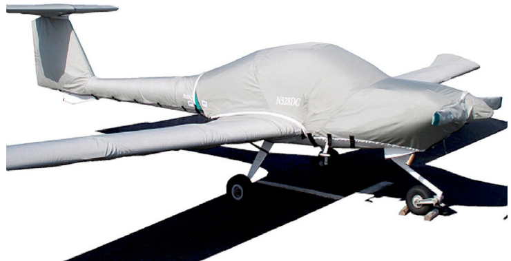
Diamond DA-20 Full Cover Set