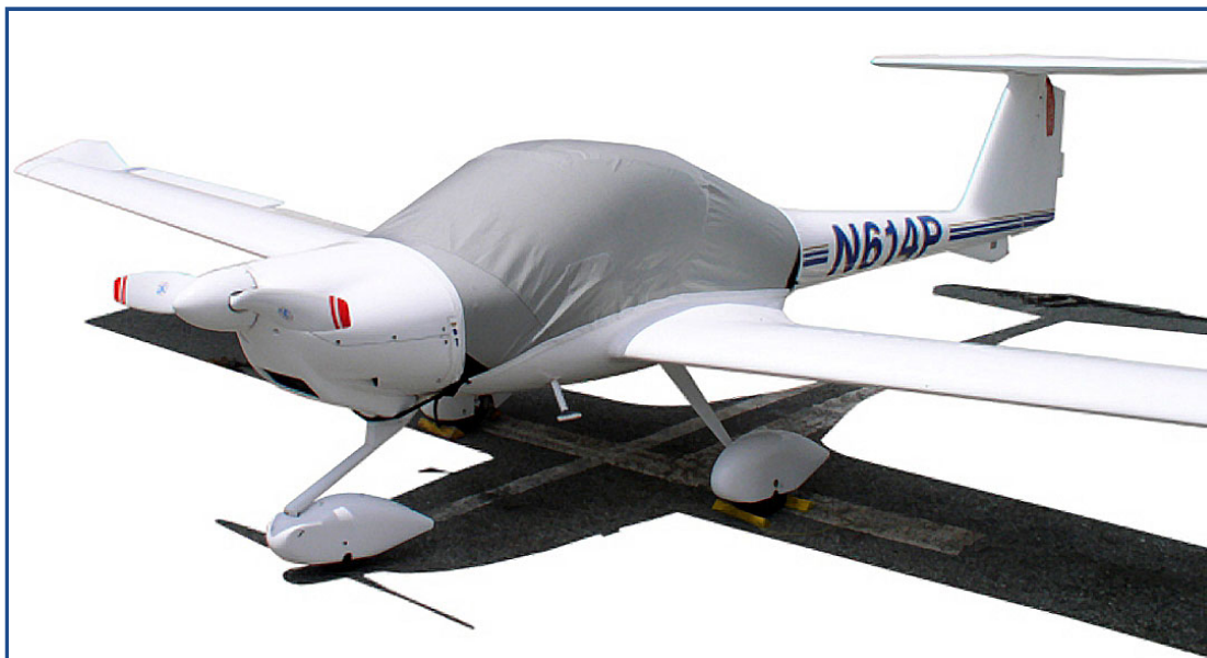
Diamond DA-20 Canopy Cover