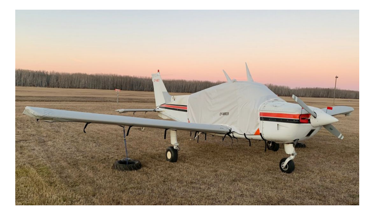
Sport B19 Engine Inlet Plugs

WINTER USE MATERIAL - Made with Solution-Dyed Polyester fabric, this option is intended for seasonal use to aid in deicing, rain mitigation, or for occasional travel. The material is lighter and more compact, but more susceptible to UV damage and may have a shorter useful life if used continuously outside than the all-year use material.