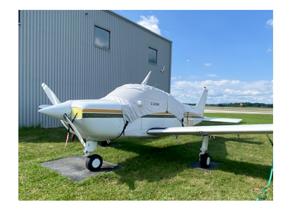
Beech Sport A19 Canopy Cover