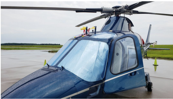
Agusta AW109S/SP Grand Heatshield Set

Heatshields are interior sunshades for an aircraft's windows or canopy glass. The product is a unique composite of closed-cell foam with a silver mylar finish. The semi-rigid design is stiff enough to stand along the inside of the windshield using sun visors or window framing. It folds up flat and easily stores in the included storage sleeve. Some designs may require velcro and suction cups. A Heatshield is an excellent short-term remedy for cockpit overheating.