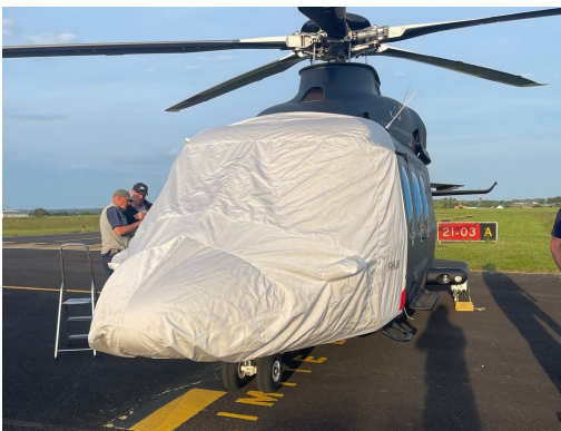
Agusta AW139 Cockpit/Nose Cover

This cover type is made from Silver Acrylic Sunbrella canvas and is 100% lined with a soft and smooth microfiber. Bruce's Custom Covers developed this material combination especially for aircraft protection. The outer material is medium weight and treated for water resistance, UV resistance and anti-static buildup. The inner lining is a very soft and smooth microfiber to prevent scratching. The material is very reflective, and tests show that the cabin interior temperature can be reduced to near-ambient temperature on the hottest of days. It is water, ice and snow repellent, yet breathable to allow moisture to escape from between the cover and the aircraft surface.