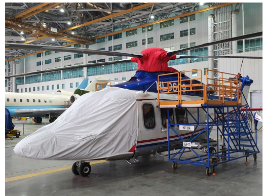
Agusta AW139 Cockpit/Nose, Rotor Mast Cover