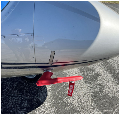
Agusta AW109 (A, C, & Trekker) Pitot Cover Set