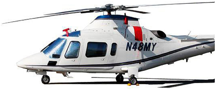
Agusta Power Pitot Covers, Intake Covers, and Cockpit Heatshield set