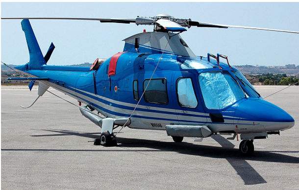
Agusta Power Cockpit HeatShields & Blade Tie-downs