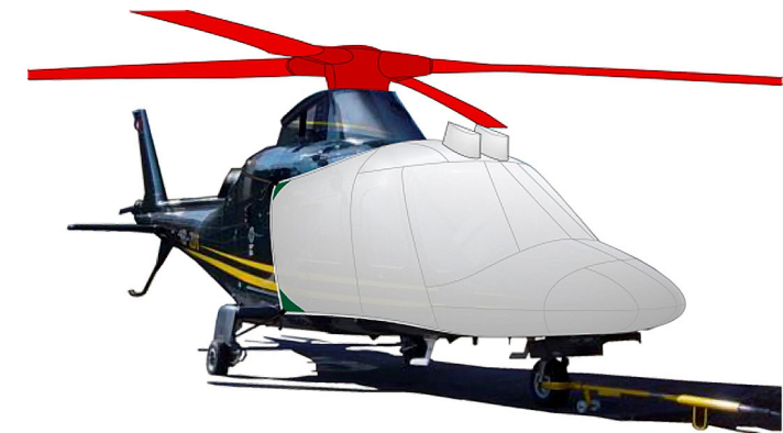
Agusta 109 Bubble, Rotor Hub & Blade Covers (illustration)

Travel Covers are made with Silver Solution-Dyed Polyester fabric and fully lined over the entire cover. The material is lightweight and more compact for easy stowage in the aircraft. The polyester material is water resistant, but only intended for occasional use outside. We also have an ultra lightweight material available for fitted hangar dust covers. For daily outdoor use, the non-travel Sunbrella Cover is the best choice.