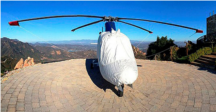
Agusta 109 Mk II+ Bubble Cover and Blade Tie-downs