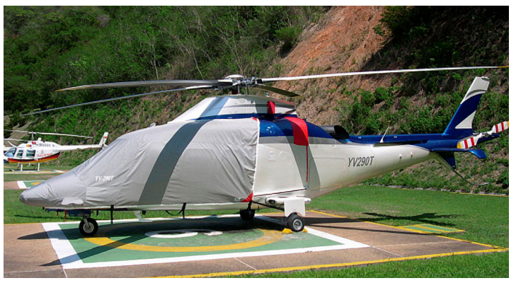
Agusta Grand Bubble Cover