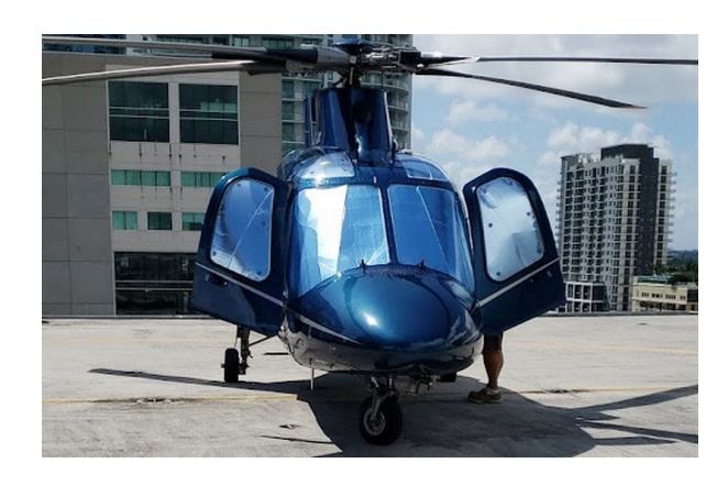
Agusta AW109 Power, A109E Heatshield Set