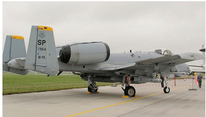
A-10 Engine Covers