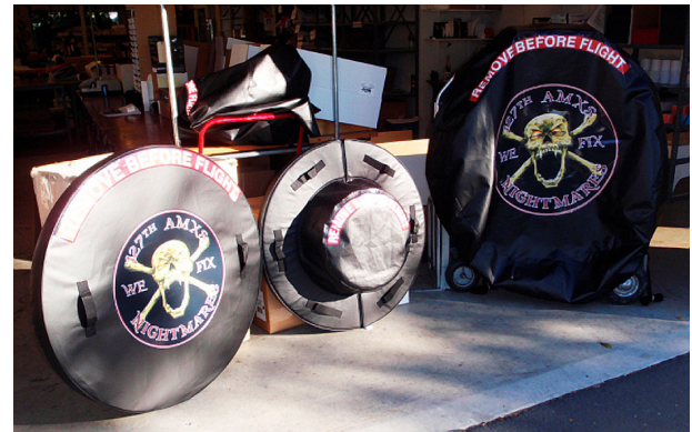
A-10 Engine Intake Plug, Exhaust Plug/Cover, Intake Cover (from left to right)