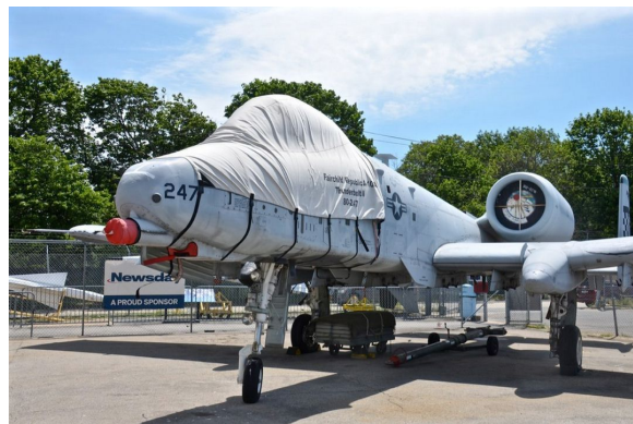
Fairchild A10 Thunderbolt Canopy Cover, Nose Gun Cover, Gun Scoop Inlet Plug