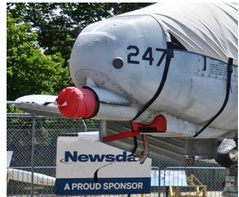
Fairchild A10 Thunderbolt Canopy Cover, Nose Gun Cover, Gun Scoop Inlet Plug Fairchild A10 Thunderbolt Nose Gun Cover, Gun Scoop Inlet Plug