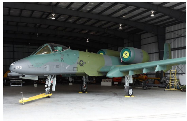
Fairchild A10 Intake Plugs, non-folding type