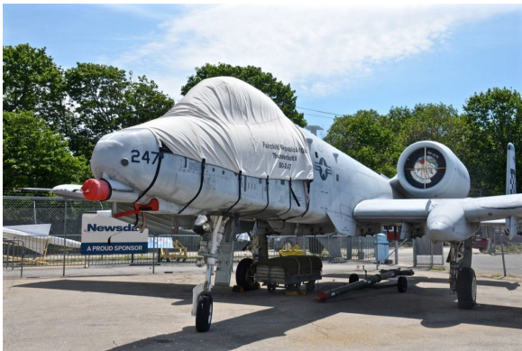
Fairchild A10 Thunderbolt Canopy Cover, Nose Gun Cover, Gun Scoop Inlet Plug

The Engine Inlet Plugs are custom fit for your Fairchild A10 Thunderbolt intakes, made with heavy-duty vinyl material, and stuffed with a single block of sculpted urethane foam. Each plug has a zipper that allows the foam to be removed and dried if necessary. Engine plugs have 'remove before flight' streamers sewn onto the face of the plugs. Most plugs are imprinted with the aircraft registration number in black for an extra charge. Storage bag NOT included. Engine plugs may be inserted after flight when the engine is still warm. Engine Inlet Plugs are commonly referred to as Cowl Plugs, Intake Plugs, Cowl Blocks, Engine Blocks, and Engine Bungs.