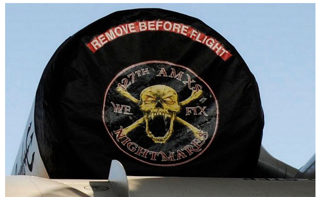
A-10 Engine Covers with Custom Artwork