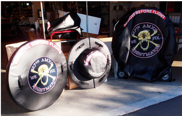
A-10 Engine Intake Plug, Exhaust Plug/Cover, Intake Cover (from left to right)

The Engine Inlet Plugs are custom fit for your Fairchild A10 Thunderbolt intakes, made with heavy-duty vinyl material, and stuffed with a single block of sculpted urethane foam. Each plug has a zipper that allows the foam to be removed and dried if necessary. Engine plugs have 'remove before flight' streamers sewn onto the face of the plugs. Most plugs are imprinted with the aircraft registration number in black for an extra charge. Storage bag NOT included. Engine plugs may be inserted after flight when the engine is still warm. Engine Inlet Plugs are commonly referred to as Cowl Plugs, Intake Plugs, Cowl Blocks, Engine Blocks, and Engine Bungs.