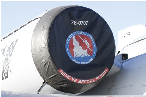
Fairchild A-10 Engine Covers

ALL-YEAR USE MATERIAL - Made with Solution dyed Polyester fabric, the all-year use material is the best option for sun protection and cover longevity. This heavier more durable material is intended for all weather conditions, such as rain and snow or lots of sun.