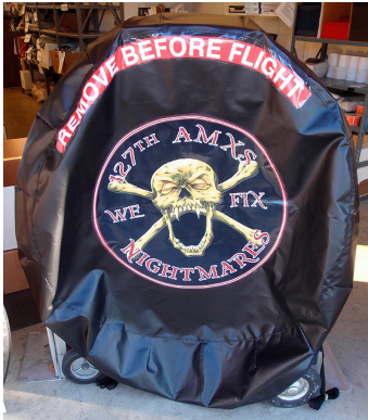
A-10 Engine Intake Cover

ALL-YEAR USE MATERIAL - Made with Solution dyed Polyester fabric, the all-year use material is the best option for sun protection and cover longevity. This heavier more durable material is intended for all weather conditions, such as rain and snow or lots of sun.