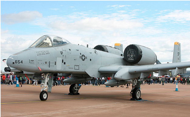
A-10 Engine Covers with Custom Artwork