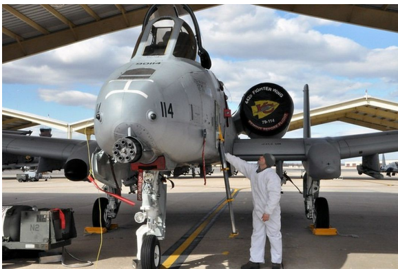
Fairchild A10 Intake Covers &amp; Nose Gun Scoop Plug

The Engine Inlet Plugs are custom fit for your Fairchild A10 Thunderbolt intakes, made with heavy-duty vinyl material, and stuffed with a single block of sculpted urethane foam. Each plug has a zipper that allows the foam to be removed and dried if necessary. Engine plugs have 'remove before flight' streamers sewn onto the face of the plugs. Most plugs are imprinted with the aircraft registration number in black for an extra charge. Storage bag NOT included. Engine plugs may be inserted after flight when the engine is still warm. Engine Inlet Plugs are commonly referred to as Cowl Plugs, Intake Plugs, Cowl Blocks, Engine Blocks, and Engine Bungs.