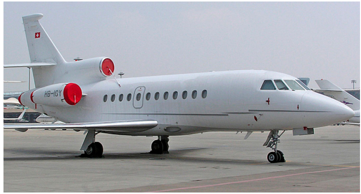
Falcon 900 Engine Covers, hook detail