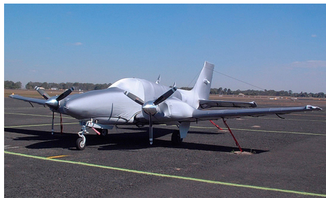
Baron FULL COVER SET, Light Weight Travel &/or Fitted Dust Cover Set