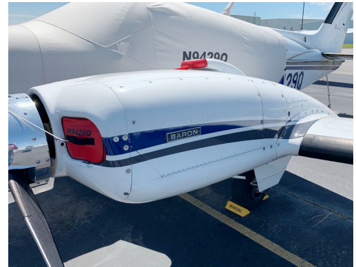
Beech Baron 58 Engine Plugs