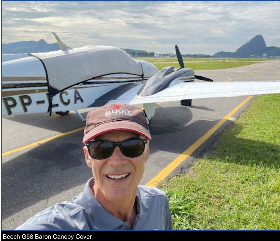
Beech G58 Baron Canopy Cover