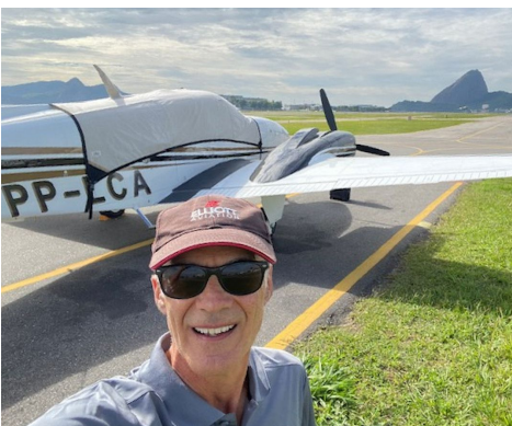
Beech G58 Baron Canopy Cover

This cover type is made from Silver Acrylic Sunbrella canvas and is 100% lined with a soft and smooth microfiber. Bruce's Custom Covers developed this material combination especially for aircraft protection. The outer material is medium weight and treated for water resistance, UV resistance and anti-static buildup. The inner lining is a very soft and smooth microfiber to prevent scratching. The material is very reflective, and tests show that the cabin interior temperature can be reduced to near-ambient temperature on the hottest of days. It is water, ice and snow repellent, yet breathable to allow moisture to escape from between the cover and the aircraft surface.