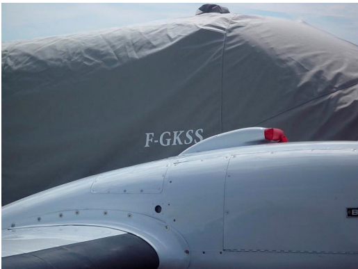
Baron Cowl Top Scoop Plugs