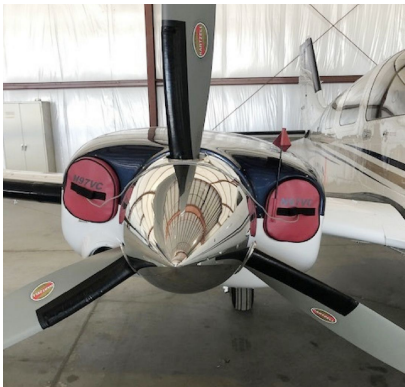
Beech Baron 58P Engine Inlet Plugs

Engine Inlet Plugs are custom fit for your Beech Baron 58TC intakes, made with heavy-duty vinyl material, and stuffed with a single block of sculpted urethane foam. Each plug has a zipper that allows the foam to be removed and dried if necessary. Engine plugs have warning flags that are visible from the cockpit or 'remove before flight' streamers sewn onto the face of the plugs. Most plugs are imprinted with the aircraft registration number in black for an extra charge. Storage bag NOT included. Engine plugs may be inserted after flight when the engine is still warm. Engine Inlet Plugs are commonly referred to as Cowl Plugs, Intake Plugs, Cowl Blocks, Engine Blocks, and Engine Bungs.