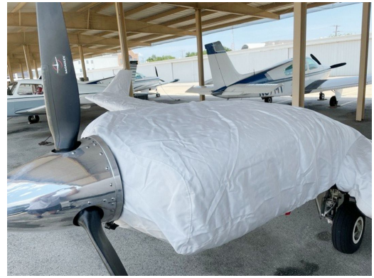
Beech Baron 58P Wing/Engine Covers (test fit)