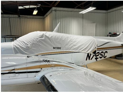
Baron 58P Canopy Cover