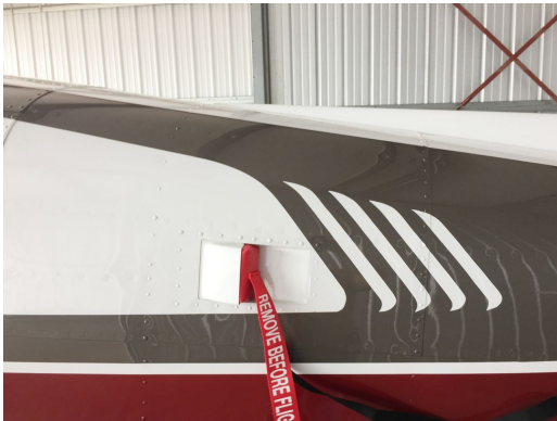
Beech Bonanza/Baron Fresh Air Intake & Exhaust Plugs

Engine Inlet Plugs are custom fit for your Beech Baron 58TC intakes, made with heavy-duty vinyl material, and stuffed with a single block of sculpted urethane foam. Each plug has a zipper that allows the foam to be removed and dried if necessary. Engine plugs have warning flags that are visible from the cockpit or 'remove before flight' streamers sewn onto the face of the plugs. Most plugs are imprinted with the aircraft registration number in black for an extra charge. Storage bag NOT included. Engine plugs may be inserted after flight when the engine is still warm. Engine Inlet Plugs are commonly referred to as Cowl Plugs, Intake Plugs, Cowl Blocks, Engine Blocks, and Engine Bungs.