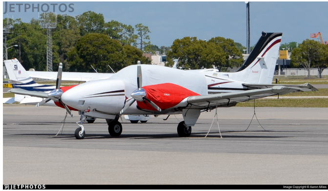
Beech Baron 58, G58 Canopy Cover, Insulated Engine Covers