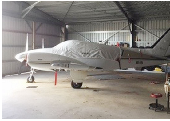
Beech Baron B-55 Canopy Cover