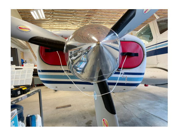
Beech Baron B-55 Engine Plugs