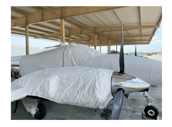
Full Cover Set (58P-020, 58P-225, 58P-405)