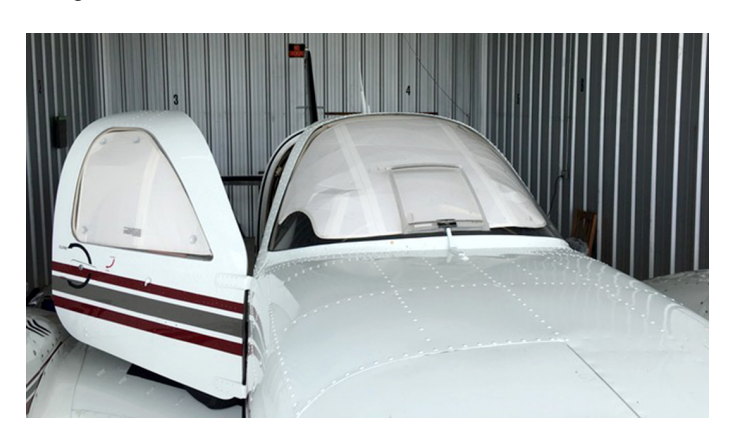
Beech Baron 58P Cockpit Heatshield Set