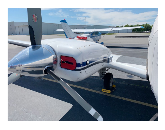
Beech Baron 58 Engine Plugs