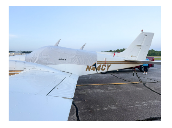
Beech Baron B55 Canopy Cover