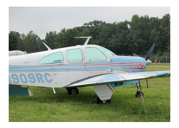
Beech Bonanza/Debonair HeatShield Set

Heatshields are interior sunshades for an aircraft's windows or canopy glass. The product is a unique composite of closed-cell foam with a silver mylar finish. The semi-rigid design is stiff enough to stand along the inside of the windshield using sun visors or window framing. It folds up flat and easily stores in the included storage sleeve. Some designs may require velcro and suction cups. A Heatshield is an excellent short-term remedy for cockpit overheating.