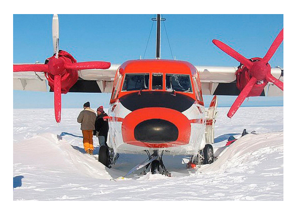
Casa 212 Insulated Engine & Propellor/Spinner Covers