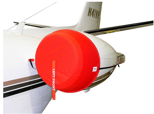
Citation Encore Intake Cover Set