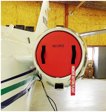
Cessna Citation S2 Intake Plugs