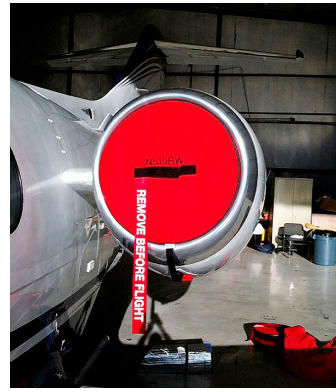
Beechjet 400A Engine Intake Plug with Generator Inlet Plug