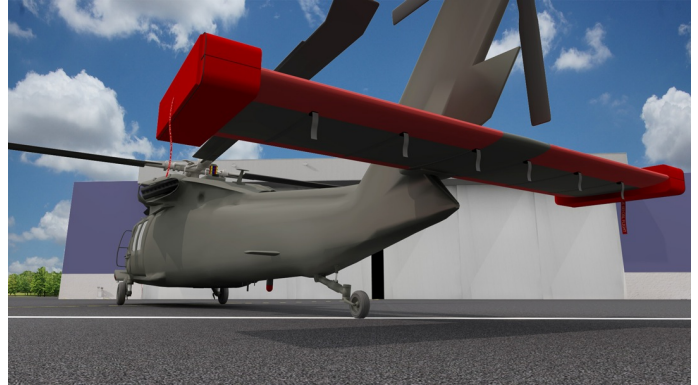
Padded Horizontal Stab Covers, Wingtip Pads (illustration)