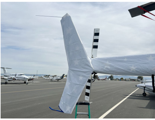
Bell 505 Tailboom & Stabilizer Covers, test fit cover