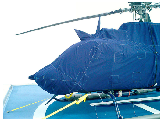
206B/206L/407 Full Body Cover