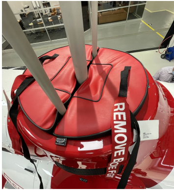
Bell 505 Swash Plate Plug

The Engine Inlet Plugs are custom fit for your Bell 505 Jet Ranger X intakes, made with heavy-duty vinyl material, and stuffed with a single block of sculpted urethane foam. Each plug has a zipper that allows the foam to be removed and dried if necessary. Engine plugs have 'Remove Before Flight' streamers sewn onto the face of the plugs. Most plugs are imprinted with the aircraft registration number in black for an extra charge. Storage bag NOT included. Engine plugs may be inserted after flight when the engine is still warm. Engine Inlet Plugs are commonly referred to as Cowl Plugs, Intake Plugs, Cowl Blocks, Engine Blocks, and Engine Bungs.