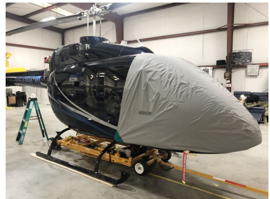
Bell 505 Light Weight Travel Bubble Cover