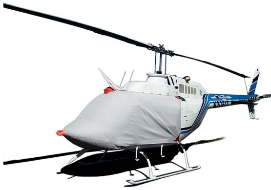
JetRanger Bubble Cover