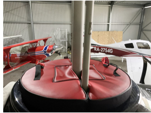
Bell 505 Jet Ranger X Swash Plate Plug