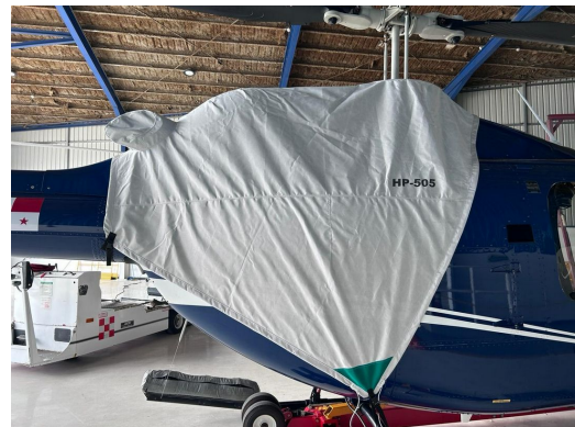
Bell 505 Engine Cover