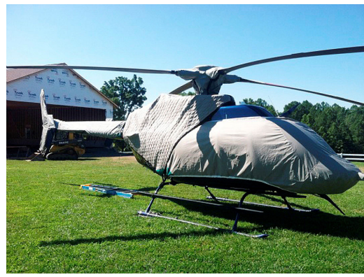
Bell 407 Covers: Bubble, Insulated Engine, Rotor Mast, Blades, Tailboom, Vertical Stabilizer and Tail Rotor