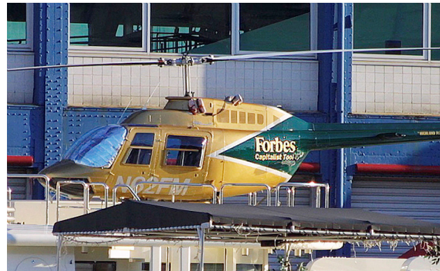
Bell 206B Jetranger Windshield HeatShields