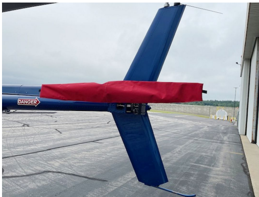
Bell 505 Jet Ranger X Tail Rotor Cover

WINTER USE MATERIAL - Made with Solution-Dyed Polyester fabric, this option is intended for seasonal use to aid in deicing, rain mitigation, or for occasional travel. The material is lighter and more compact, but more susceptible to UV damage and may have a shorter useful life if used continuously outside than the all-year use material.