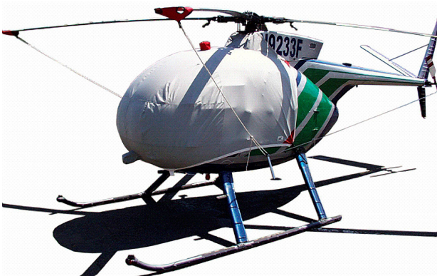
MD520 NOTAR Bubble, Engine, & NOTAR Covers & Blade Tie-downs Hughes 500C Bubble Cover with Intake Add-on, Blade Tie-downs