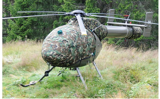
McDonnell Douglas MDD 520 Notar Bubble Cover, with special missions equipment.