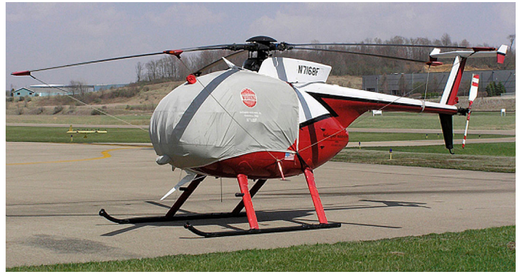
Hughes 500D Bubble Cover with Wire Strike detail and Blade Tie-downs