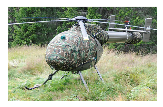
MD520 NOTAR Bubble, Engine, & NOTAR Covers & Blade Tiedowns