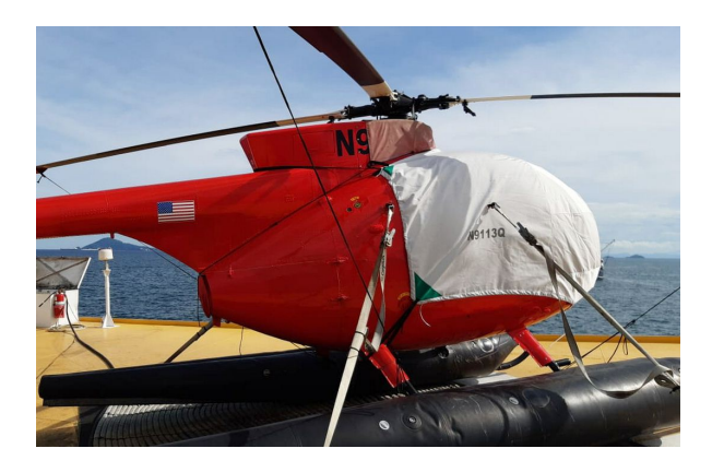
Hughes 500C (369HS) Bubble Cover