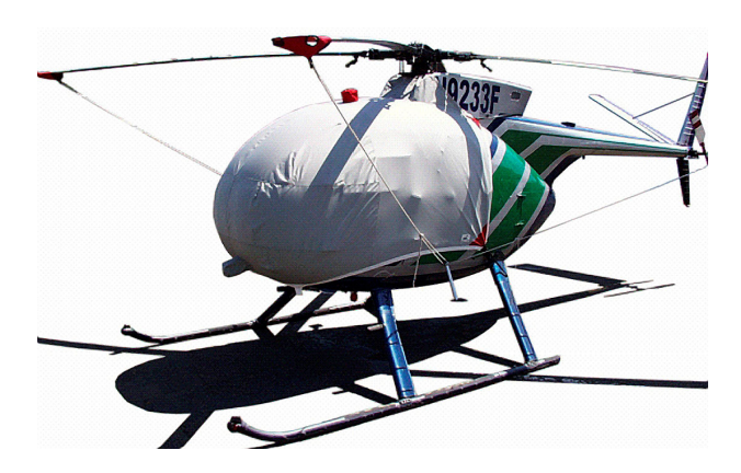
Hughes 500C Bubble Cover with Intake Add-on, Blade Tiedowns

Travel Covers are made with Silver Solution-Dyed Polyester fabric and fully lined over the entire cover. The material is lightweight and more compact for easy stowage in the aircraft. The polyester material is water resistant, but only intended for occasional use outside. We also have an ultra lightweight material available for fitted hangar dust covers. For daily outdoor use, the non-travel Sunbrella Cover is the best choice.