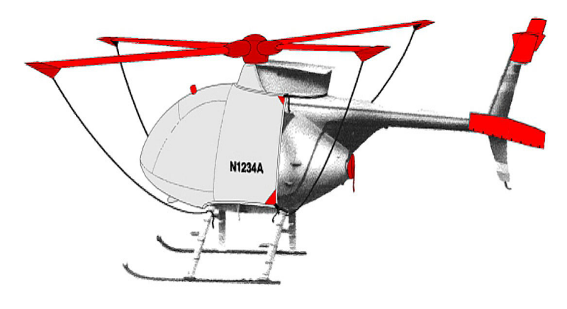
Full Cover Set

The Tailboom Cover details vary by model, but generally the helicopter tail boom cover encloses the tail boom from the "bottleneck" to the aft end. They usually also cover the horizontal stabilizers, and are custom made to allow for antennae, lights, and other protrusions. They attach with straps underneath the tail boom. Covers for the vertical and horizontal stabilizers are also available separately. Specific information for each model is available on request.