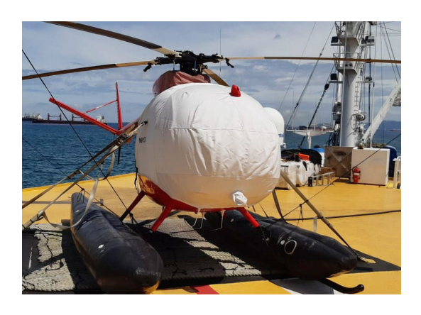
Hughes 500C (369HS) Bubble Cover