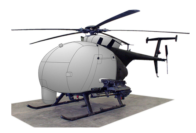
MH-6J Bubble, Flir & Doghouse Covers (illustration)