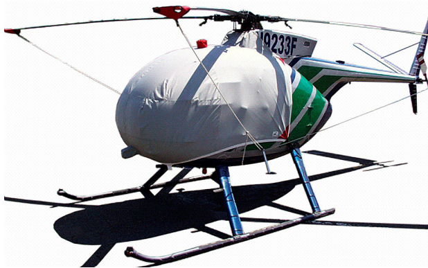
Hughes 500C Bubble Cover with Intake Add-on, Blade Tie-downs

Travel Covers are made with Silver Solution-Dyed Polyester fabric and fully lined over the entire cover. The material is lightweight and more compact for easy storage in the aircraft. The polyester material is water resistant, but only intended for occasional use outside. We also have an ultra lightweight material available for fitted hangar dust covers. For daily outdoor use, the non-travel Sunbrella Cover is the best choice.