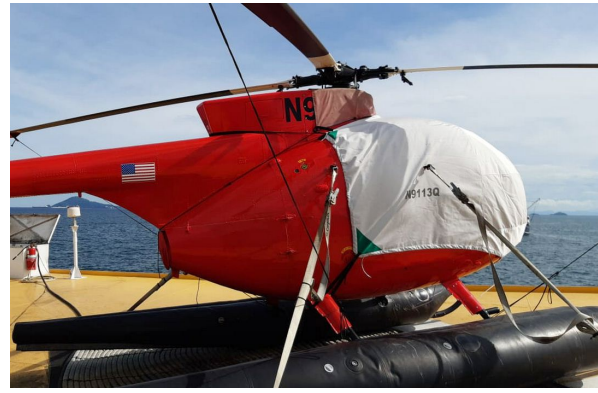
Hughes 500C (369HS) Bubble Cover