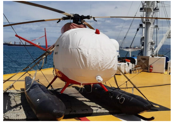
Hughes 500C (369HS) Bubble Cover