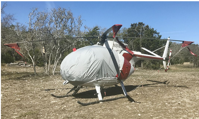
Hughes 500C, OH-6A Bubble Cover

WINTER USE MATERIAL - Made with Solution-Dyed Polyester fabric, this option is intended for seasonal use to aid in deicing, rain mitigation, or for occasional travel. The material is lighter and more compact, but more susceptible to UV damage and may have a shorter useful life if used continuously outside than the all-year use material.