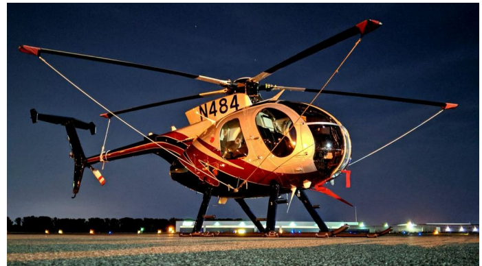
Hughes 500D Blade Tie-Downs