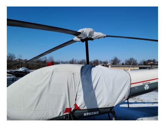
Enstrom 280C Shark Bubble, Engine & Rotor Hub Covers