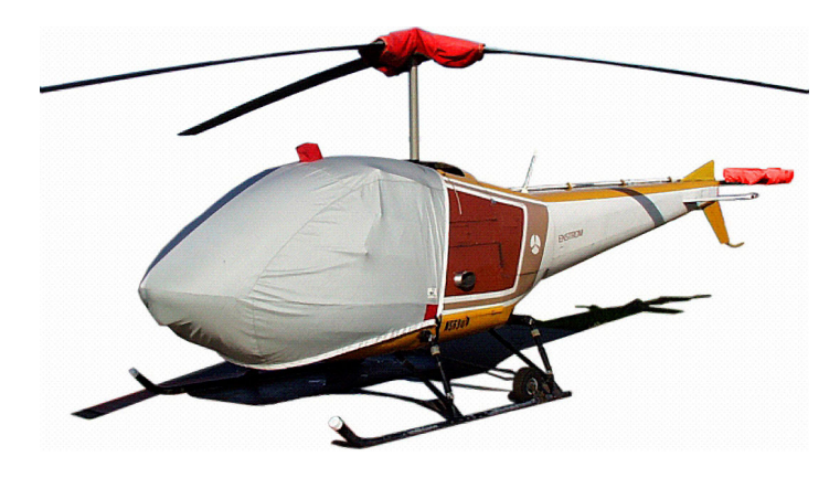
Enstrom 280FX Bubble, Main Rotor Mast, Tail Rotor Covers on Enstrom F280FX