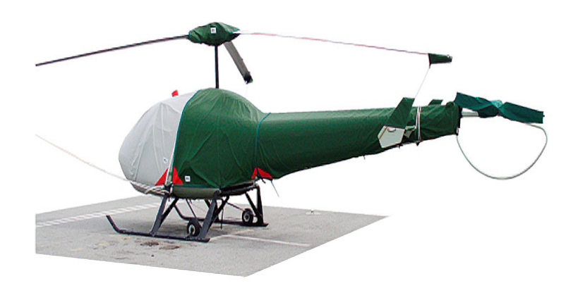
Enstrom 280FX Bubble, Engine, Tailboom, Main & Tail Rotor Covers