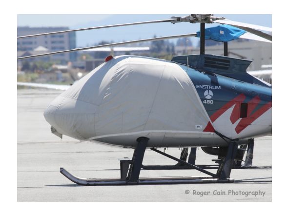
Enstrom 480 Bubble Cover