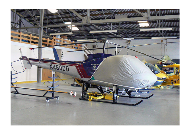
Enstrom 480 Bubble Cover