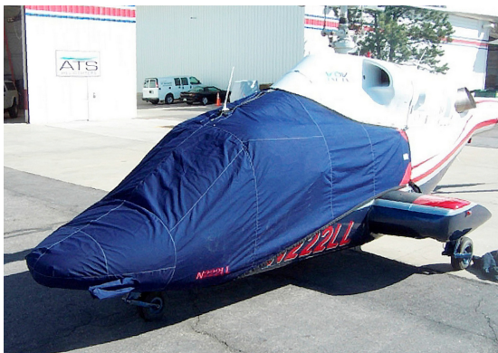
Bell 222 Bubble Cover

This cover type is made from Silver Acrylic Sunbrella canvas and is 100% lined with a soft and smooth microfiber. Bruce's Custom Covers developed this material combination especially for aircraft protection. The outer material is medium weight and treated for water resistance, UV resistance and anti-static buildup. The inner lining is a very soft and smooth microfiber to prevent scratching. The material is very reflective, and tests show that the cabin interior temperature can be reduced to near-ambient temperature on the hottest of days. It is water, ice and snow repellent, yet breathable to allow moisture to escape from between the cover and the aircraft surface.