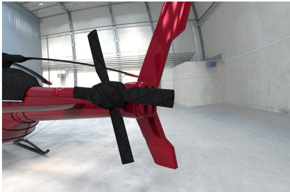
Bell 429 Tail Rotor Cover

WINTER USE MATERIAL - Made with Solution-Dyed Polyester fabric, this option is intended for seasonal use to aid in deicing, rain mitigation, or for occasional travel. The material is lighter and more compact, but more susceptible to UV damage and may have a shorter useful life if used continuously outside than the all-year use material.