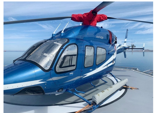
Bell 429 Cockpit & Cabin HeatShields, Rotor Mast/Drive Shafts Cover