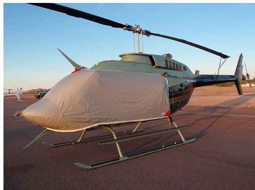
Bell 206L Longranger Bubble Cover

Travel Covers are made with Silver Solution-Dyed Polyester fabric and fully lined over the entire cover. The material is lightweight and more compact for easy stowage in the aircraft. The polyester material is water resistant, but only intended for occasional use outside. We also have an ultra lightweight material available for fitted hangar dust covers. For daily outdoor use, the non-travel Sunbrella Cover is the best choice.