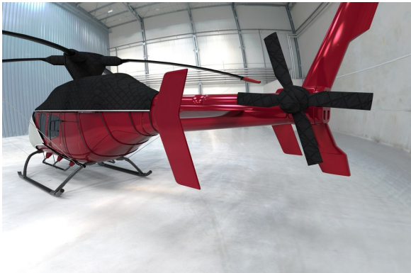
Bell 429 Tail Rotor, Engine, Rotor Hub Covers