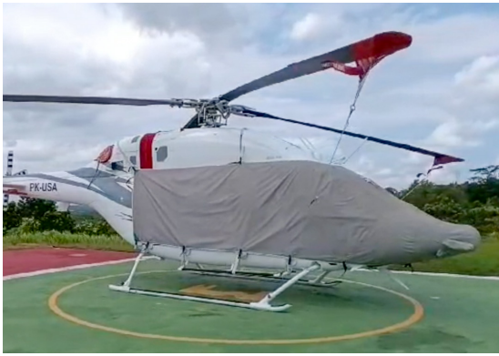
Bell 429 Bubble Cover