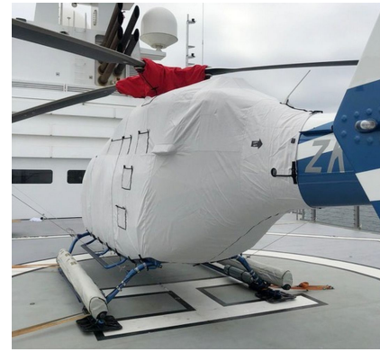
Bell 429 Main Body Cover, Rotor Hub & Tail Rotor Covers