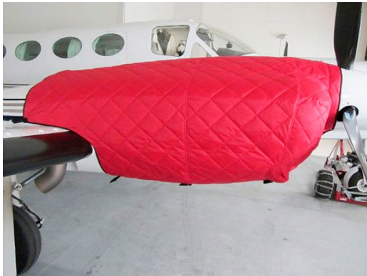
Cessna 421 Insulated Engine Covers

This cover type is made from Silver Acrylic Sunbrella canvas and is 100% lined with a soft and smooth microfiber. Bruce's Custom Covers developed this material combination especially for aircraft protection. The outer material is medium weight and treated for water resistance, UV resistance and anti-static buildup. The inner lining is a very soft and smooth microfiber to prevent scratching. The material is very reflective, and tests show that the cabin interior temperature can be reduced to near-ambient temperature on the hottest of days. It is water, ice and snow repellent, yet breathable to allow moisture to escape from between the cover and the aircraft surface.