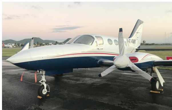
Cessna 414 Propellor/Spinner Covers, 3 Blade

Heatshields are interior sunshades for an aircraft's windows or canopy glass. The product is a unique composite of closed-cell foam with a silver mylar finish. The semi-rigid design is stiff enough to stand along the inside of the windshield using sun visors or window framing. It folds up flat and easily stores in the included storage sleeve. Some designs may require velcro and suction cups. A Heatshield is an excellent short-term remedy for cockpit overheating.