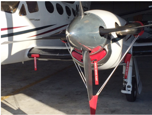
Cessna Conquest I Prop Tie/Exhaust Covers, Engine Plugs

plugs are imprinted with the aircraft registration number in black for an extra charge. Storage bag NOT included. Engine plugs may be inserted after flight when the engine is still warm. Engine Inlet Plugs are commonly referred to as Cowl Plugs, Intake Plugs, Cowl Blocks, Engine Blocks, and Engine Bunges.