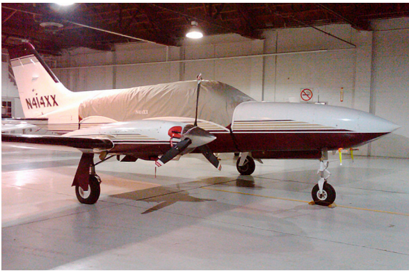
Cessna 414 Canopy Cover and Engine Inlet Plugs

Travel Covers are made with Silver Solution-Dyed Polyester fabric and only lined over the windshield to save weight. The material is lightweight and more compact for easy stowage in the aircraft. The polyester material is water resistant, but only intended for occasional use outside. We also have an ultra lightweight material available for fitted hangar dust covers. For daily outdoor use, the non-travel Sunbrella Cover is the best choice.