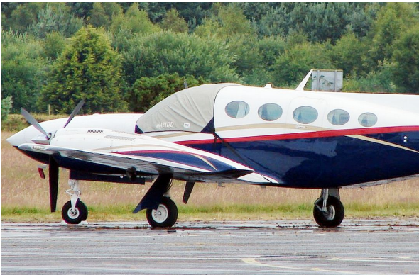
Cessna 421 Cockpit Cover