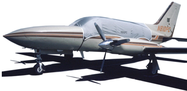
Cessna 421 Cockpit/Windshield Cover

Covers developed this material combination especially for aircraft protection. The outer material is medium weight and treated for water resistance, UV resistance and anti-static buildup. The inner lining is a very soft and smooth microfiber to prevent scratching. The material is very reflective, and tests show that the cabin interior temperature can be reduced to near-ambient temperature on the hottest of days. It is water, ice and snow repellent, yet breathable to allow moisture to escape from between the cover and the aircraft surface.