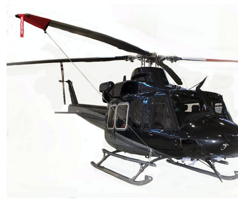
BLADE TIE DOWNS