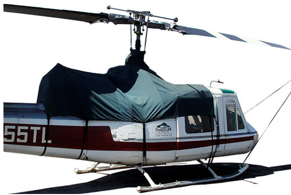
Bell 204/205 Engine/Mid-Cabin Cover

WINTER USE MATERIAL - Made with Solution-Dyed Polyester fabric, this option is intended for seasonal use to aid in deicing, rain mitigation, or for occasional travel. The material is lighter and more compact, but more susceptible to UV damage and may have a shorter useful life if used continuously outside than the all-year use material.