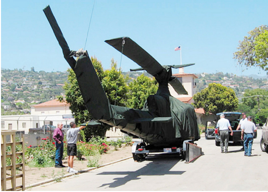
Bell 204/205 Full Body Cover Set

Canopy/Nose Covers enclose the entire canopy including the windshield, skylights, and chin bubble. Attachment buckles are made of nonmetal Delrin , designed for rugged outdoor use. Both the top and bottom hems of the cover have a special rope-hem feature with which they can be tightened to help prevent abrasive chafing of the windshield. Pockets are sewn into the cover for the temperature probe and pitot tubes. The bubble cover is reinforced with patches at hinge points, door handles, and for the windshield wipers. For ease of installation, the bubble cover is color-coded (red=left, green=right) with color swatches sewn into the corners. This cover type is made from Silver Acrylic Sunbrella canvas and is 100% lined with a soft and smooth microfiber. Bruce's Custom Covers developed this material combination especially for aircraft protection. The outer material is medium weight and treated for water resistance, UV resistance and anti-static buildup. The inner lining is a very soft and smooth microfiber to prevent scratching. The material is very reflective, and tests show that the cabin interior temperature can be reduced to near-ambient temperature on the hottest of days. It is water, ice and snow repellent, yet breathable to allow moisture to escape from between the cover and the aircraft surface.