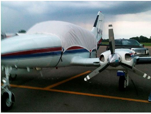
Cessna 401B Canopy Cover