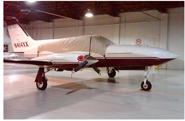
Cessna 414 Canopy Cover and Engine Inlet Plugs