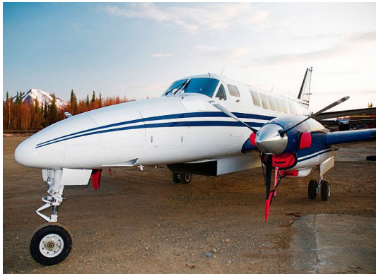
Beech 99 Engine Plugs & Prop Ties