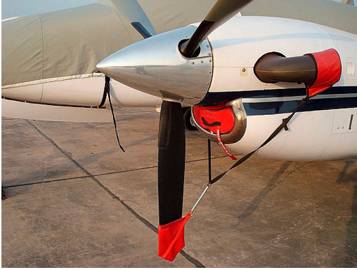
Prop Tie-down/Exhaust Covers

The material is very reflective, and tests show that the cabin interior temperature can be reduced to near-ambient temperature on the hottest of days. It is water, ice and snow repellent, yet breathable to allow moisture to escape from between the cover and the aircraft surface.