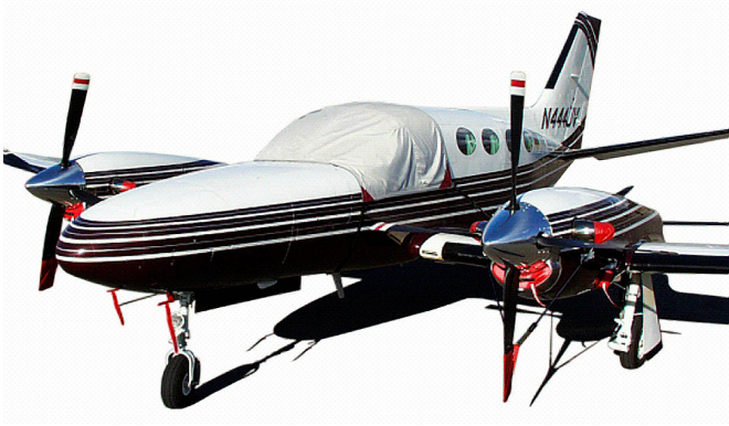
Cessna 425 Cockpit Cover

This cover type is made from Silver Acrylic Sunbrella canvas and is 100% lined with a soft and smooth microfiber. Bruce's Custom Covers developed this material combination especially for aircraft protection. The outer material is medium weight and treated for water resistance, UV resistance and anti-static buildup. The inner lining is a very soft and smooth microfiber to prevent scratching. The material is very reflective, and tests show that the cabin interior temperature can be reduced to near-ambient temperature on the hottest of days. It is water, ice and snow repellent, yet breathable to allow moisture to escape from between the cover and the aircraft surface.