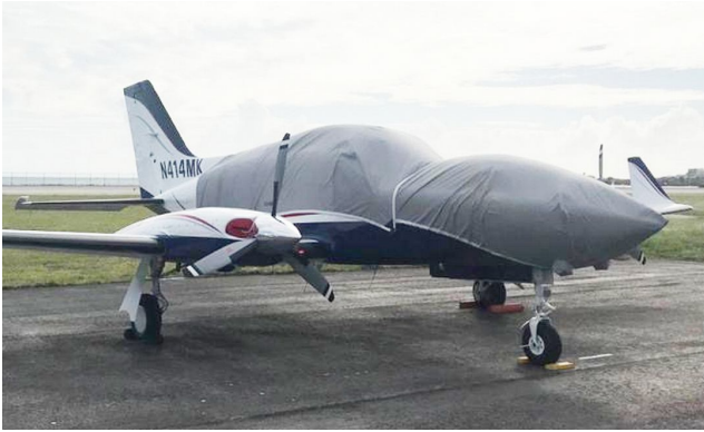
Cessna 414 Travel Cover, Light Weight Canopy Cover

non-travel Sunbrella Cover is the best choice.