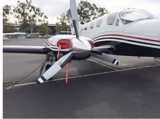
Cessna 414 Engine Inlet Plugs