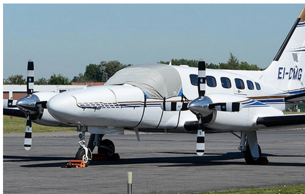
Cessna 441 Cockpit Cover

This cover type is made from Silver Acrylic Sunbrella canvas and is 100% lined with a soft and smooth microfiber. Bruce's Custom Covers developed this material combination especially for aircraft protection. The outer material is medium weight and treated for water resistance, UV resistance and anti-static buildup. The inner lining is a very soft and smooth microfiber to prevent scratching. The material is very reflective, and tests show that the cabin interior temperature can be reduced to near-ambient temperature on the hottest of days. It is water, ice and snow repellent, yet breathable to allow moisture to escape from between the cover and the aircraft surface.