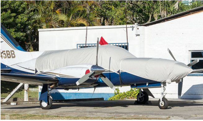
Cessna 421 Canopy Cover & Nose Cover

non-travel Sunbrella Cover is the best choice.