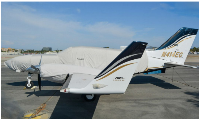
Cessna 414A Extended Canopy/Nose Cover & Engine Covers

This cover type is made from Silver Acrylic Sunbrella canvas and is 100% lined with a soft and smooth microfiber. Bruce's Custom Covers developed this material combination especially for aircraft protection. The outer material is medium weight and treated for water resistance, UV resistance and anti-static buildup. The inner lining is a very soft and smooth microfiber to prevent scratching. The material is very reflective, and tests show that the cabin interior temperature can be reduced to near-ambient temperature on the hottest of days. It is water, ice and snow repellent, yet breathable to allow moisture to escape from between the cover and the aircraft surface.