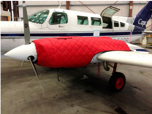
Cessna 402 Insulated Engine Cover

This cover type is made from Silver Acrylic Sunbrella canvas and is 100% lined with a soft and smooth microfiber. Bruce's Custom Covers developed this material combination especially for aircraft protection. The outer material is medium weight and treated for water resistance, UV resistance and anti-static buildup. The inner lining is a very soft and smooth microfiber to prevent scratching. The material is very reflective, and tests show that the cabin interior temperature can be reduced to near-ambient temperature on the hottest of days. It is water, ice and snow repellent, yet breathable to allow moisture to escape from between the cover and the aircraft surface.