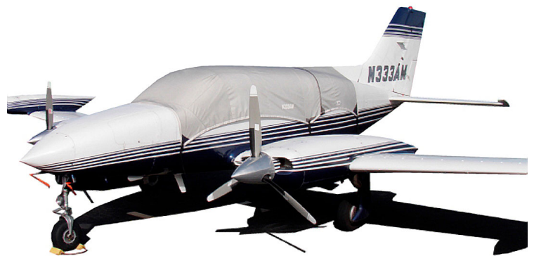
Cessna 414 Canopy Cover & Pitot Covers