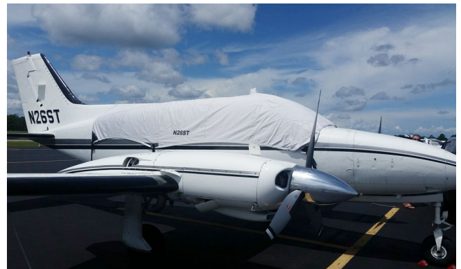
Cessna 414 Canopy Cover