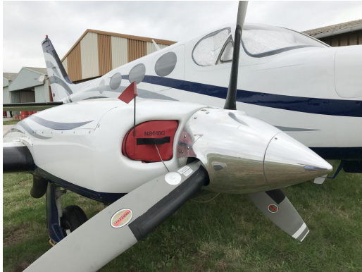
Cessna 340 Engine Inlet Plugs

Engine Inlet Plugs are custom fit for your Cessna 402 intakes, made with heavy-duty vinyl material, and stuffed with a single block of sculpted urethane foam. Each plug has a zipper that allows the foam to be removed and dried if necessary. Engine plugs have warning flags that are visible from the cockpit or 'remove before flight' streamers sewn onto the face of the plugs. Most plugs are imprinted with the aircraft registration number in black for an extra charge. Storage bag NOT included. Engine plugs may be inserted after flight when the engine is still warm. Engine Inlet Plugs are commonly referred to as Cowl Plugs, Intake Plugs, Cowl Blocks, Engine Blocks, and Engine Bungs.