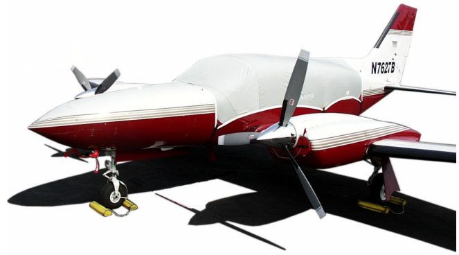
Cessna 421C Canopy Cover & Engine Plugs