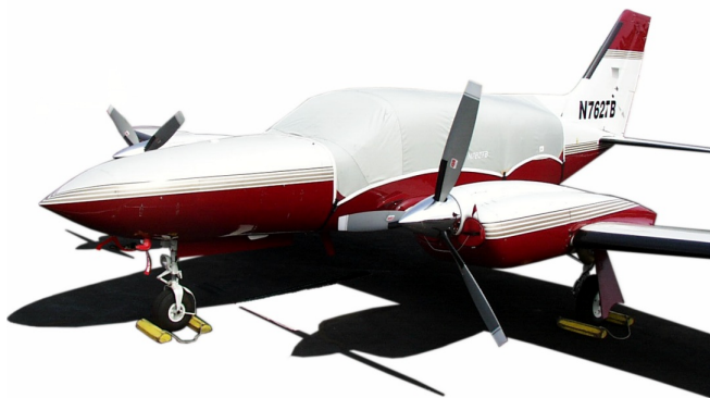
Cessna 421C Canopy Cover & Engine Plugs

The Cessna 402 Nose Cover is designed to cover the section of the fuselage forward of the windshield to the tip of the nose. It is secured with belly straps. This cover type is made from Silver Acrylic Sunbrella canvas and is 100% lined with a soft and smooth microfiber. Bruce's Custom Covers developed this material combination especially for aircraft protection. The outer material is medium weight and treated for water resistance, UV resistance and anti-static buildup. The inner lining is a very soft and smooth microfiber to prevent scratching. The material is very reflective, and tests show that the cabin interior temperature can be reduced to near-ambient temperature on the hottest of days. It is water, ice and snow repellent, yet breathable to allow moisture to escape from between the cover and the aircraft surface.