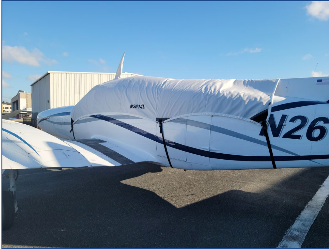
Cessna 402C Canopy Cover