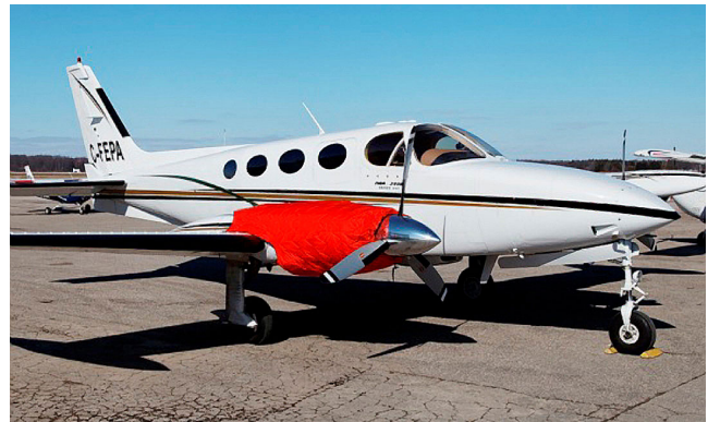
Cessna 340 Insulated Engine Covers