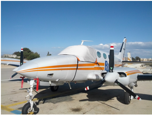
Cessna 340 Cockpit/Windshield Cover