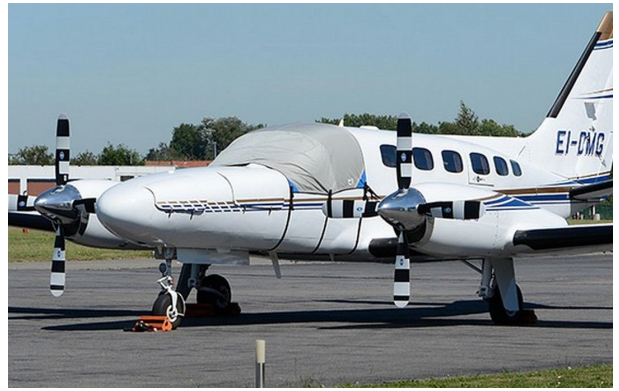
Cessna 441 Cockpit Cover