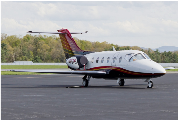
Nextant 400XTi Cockpit HeatShields, Bikini Type Engine Covers

This cover type is made from Silver Acrylic Sunbrella canvas and is 100% lined with a soft and smooth microfiber. Bruce's Custom Covers developed this material combination especially for aircraft protection. The outer material is medium weight and treated for water resistance, UV resistance and anti-static buildup. The inner lining is a very soft and smooth microfiber to prevent scratching. The material is very reflective, and tests show that the cabin interior temperature can be reduced to near-ambient temperature on the hottest of days. It is water, ice and snow repellent, yet breathable to allow moisture to escape from between the cover and the aircraft surface.