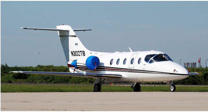
Nextant 400XTi Engine Covers in Blue