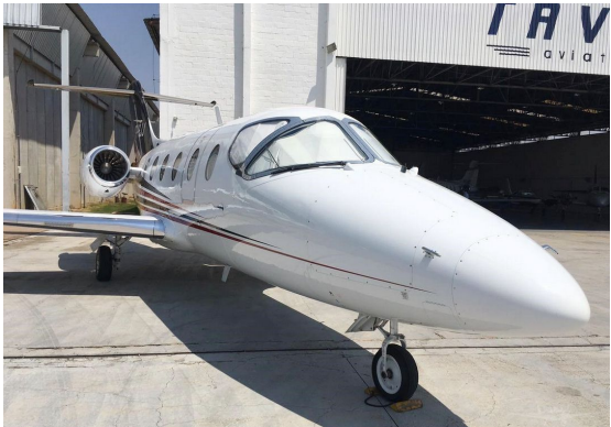
Beechjet Cockpit Heatshields

Cockpit Heatshields are interior sunshades for the aircraft's cockpit. The product is a unique composite of closed-cell foam with a silver mylar finish. The semi-rigid design is stiff enough to stand inside the window framing. The set folds up flat and is easily stored in the included storage sleeve. Some designs may require velcro and suction cups. Our Heatshields for jets are offered white side out because some aircraft manufacturers have issued advisories against reflective window inserts due to potential heat damage. A Heatshield is an excellent short-term remedy for cockpit overheating, but an external fabric cover is more effective for long-term protection.