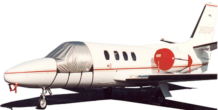
Cessna Citation Windshield, Pitot and Engine Covers