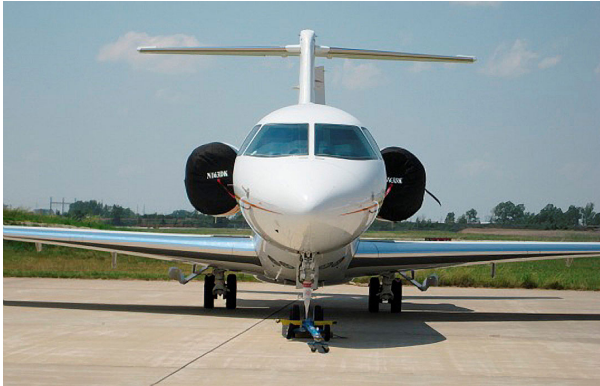
Hawker 4000 Intake Covers

The Hawker Beechcraft 4000 Horizon Intake Covers are designed to install easily yet be completely storable. A spring steel hoop is sewn into the hem of each cover, allowing them to be installed without climbing onto the wing or using a stepladder. To store the covers the spring steel hoop folds like a band-saw blade into three nesting rings. Each cover folds into a compact circular bundle which is stored in the included duffle bag, yet they unfold quickly for use. The Tri-Fold Ring cover is made of medium weight nylon which is available in a variety of colors to match the paint trim. Each cover set comes complete with installation and folding instructions. The aircraft's registration number can be silkscreened onto the cover for an extra charge.