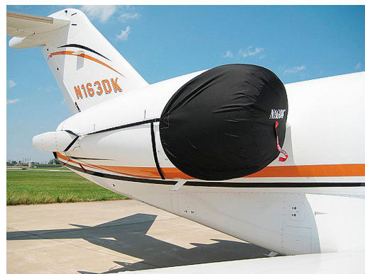
Hawker 4000 Intake Cover