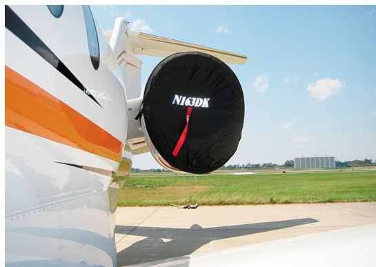
Hawker 4000 Intake Cover

The Hawker Beechcraft 4000 Horizon Intake Covers are designed to install easily yet be completely storable. A spring steel hoop is sewn into the hem of each cover, allowing them to be installed without climbing onto the wing or using a stepladder. To store the covers the spring steel hoop folds like a band-saw blade into three nesting rings. Each cover folds into a compact circular bundle which is stored in the included duffle bag, yet they unfold quickly for use. The Tri-Fold Ring cover is made of medium weight nylon which is available in a variety of colors to match the paint trim. Each cover set comes complete with installation and folding instructions. The aircraft's registration number can be silkscreened onto the cover for an extra charge.