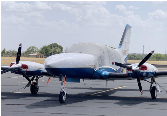
Cessna 414 Travel Weight Canopy Cover, Engine Plugs

Travel Covers are made with Silver Solution-Dyed Polyester fabric and only lined over the windshield to save weight. The material is lightweight and more compact for easy stowage in the aircraft. The polyester material is water resistant, but only intended for occasional use outside. We also have an ultra lightweight material available for fitted hangar dust covers. For daily outdoor use, the non-travel Sunbrella Cover is the best choice.