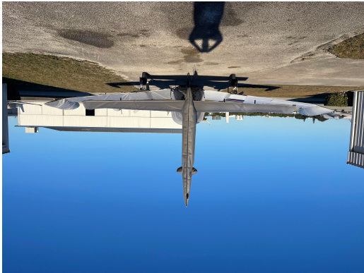
Cessna 340 Empennage Cover, Wing/Engine Covers