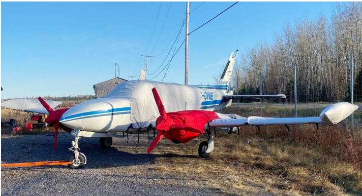
Cessna 340A Extended Canopy, Wing, Insulated Engine & Prop Covers