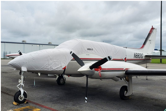
Cessna 340A Canopy/Nose Cover

This cover type is made from Silver Acrylic Sunbrella canvas and is 100% lined with a soft and smooth microfiber. Bruce's Custom Covers developed this material combination especially for aircraft protection. The outer material is medium weight and treated for water resistance, UV resistance and anti-static buildup. The inner lining is a very soft and smooth microfiber to prevent scratching. The material is very reflective, and tests show that the cabin interior temperature can be reduced to near-ambient temperature on the hottest of days. It is water, ice and snow repellent, yet breathable to allow moisture to escape from between the cover and the aircraft surface.