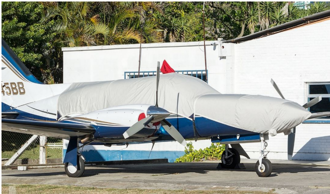
Cessna 421 Canopy Cover & Nose Cover