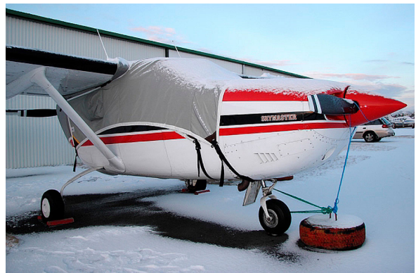
Cessna 337 Skymaster Canopy Cover w/ 14" bib ext., goes back to rear engine inlet and hooks to t.e.