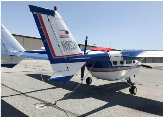
Cessna Skymaster 337G Rear Engine Inlet Cover

Engine Inlet Plugs are custom fit for your Cessna 336 (Fixed Gear Skymaster) intakes, made with heavy-duty vinyl material, and stuffed with a single block of sculpted urethane foam. Each plug has a zipper that allows the foam to be removed and dried if necessary. Engine plugs have warning flags that are visible from the cockpit or 'remove before flight' streamers sewn onto the face of the plugs. Most plugs are imprinted with the aircraft registration number in black for an extra charge. Storage bag NOT included. Engine plugs may be inserted after flight when the engine is still warm. Engine Inlet Plugs are commonly referred to as Cowl Plugs, Intake Plugs, Cowl Blocks, Engine Blocks, and Engine Bung.