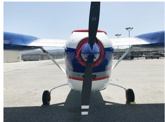
Cessna 337 Skymaster Rear Engine Plugs, Rear Engine Inlet Cover (SOLD SEPARATELY)