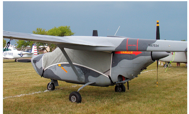
Cessna 337 Skymaster Canopy Cover w/ 14" bib ext.