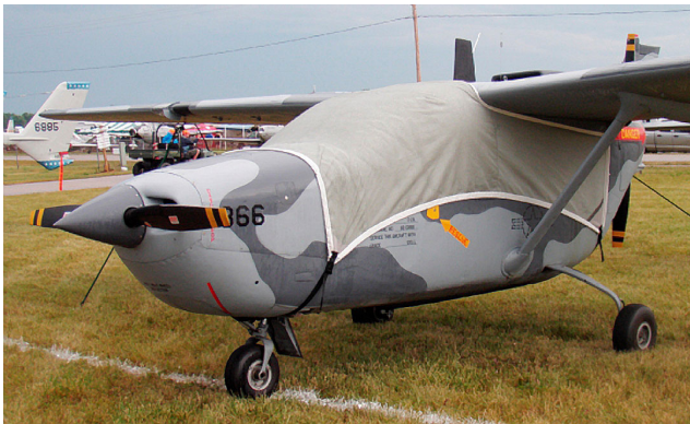
Cessna 337 Skymaster Canopy Cover w/ 14" bib ext.

This cover type is made from Silver Acrylic Sunbrella canvas and is 100% lined with a soft and smooth microfiber. Bruce's Custom Covers developed this material combination especially for aircraft protection. The outer material is medium weight and treated for water resistance, UV resistance and anti-static buildup. The inner lining is a very soft and smooth microfiber to prevent scratching. The material is very reflective, and tests show that the cabin interior temperature can be reduced to near-ambient temperature on the hottest of days. It is water, ice and snow repellent, yet breathable to allow moisture to escape from between the cover and the aircraft surface.