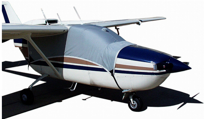
Cessna Skymaster Canopy Cover with Forward Extension

This cover type is made from Silver Acrylic Sunbrella canvas and is 100% lined with a soft and smooth microfiber. Bruce's Custom Covers developed this material combination especially for aircraft protection. The outer material is medium weight and treated for water resistance, UV resistance and anti-static buildup. The inner lining is a very soft and smooth microfiber to prevent scratching. The material is very reflective, and tests show that the cabin interior temperature can be reduced to near-ambient temperature on the hottest of days. It is water, ice and snow repellent, yet breathable to allow moisture to escape from between the cover and the aircraft surface.