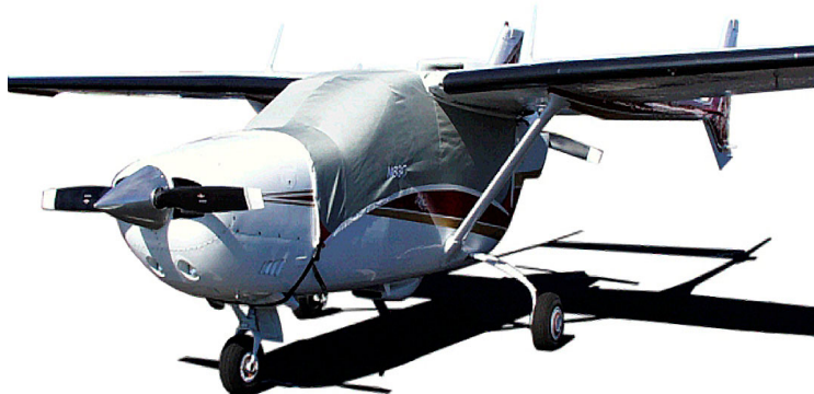
Cessna Skymaster Canopy Cover w/ 14" bib ext.