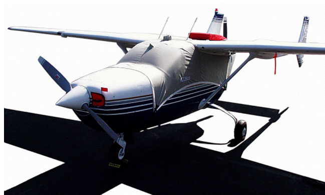
Cessna Skymaster Canopy Cover with Forward Extension, Fwd. Engine Plugs, Aft Engine Cover

This cover type is made from Silver Acrylic Sunbrella canvas and is 100% lined with a soft and smooth microfiber. Bruce's Custom Covers developed this material combination especially for aircraft protection. The outer material is medium weight and treated for water resistance, UV resistance and anti-static buildup. The inner lining is a very soft and smooth microfiber to prevent scratching. The material is very reflective, and tests show that the cabin interior temperature can be reduced to near-ambient temperature on the hottest of days. It is water, ice and snow repellent, yet breathable to allow moisture to escape from between the cover and the aircraft surface.