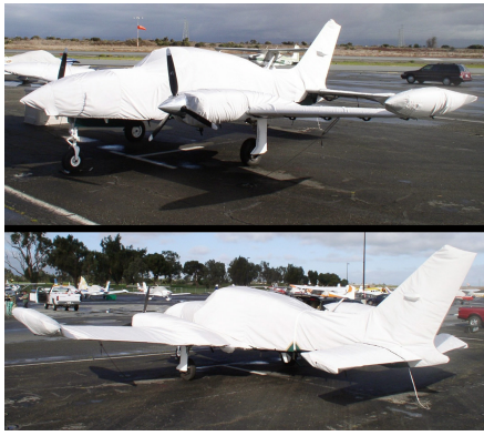
Cessna 310 Complete Cover Set