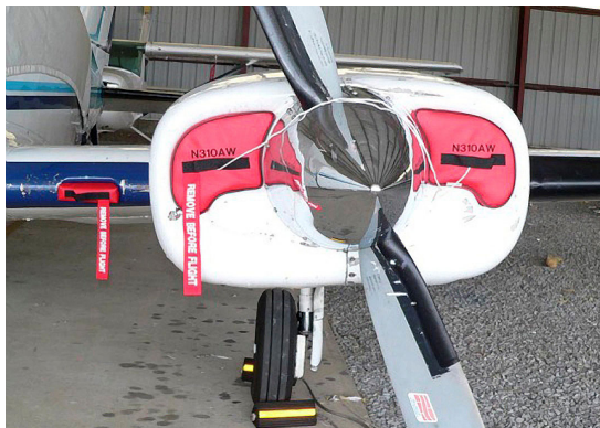
Cessna 310P Engine Inlet and Center Section Inlet Plugs

Engine Inlet Plugs are custom fit for your Cessna 320 intakes, made with heavy-duty vinyl material, and stuffed with a single block of sculpted urethane foam. Each plug has a zipper that allows the foam to be removed and dried if necessary. Engine plugs have warning flags that are visible from the cockpit or 'remove before flight' streamers sewn onto the face of the plugs. Most plugs are imprinted with the aircraft registration number in black for an extra charge. Storage bag NOT included. Engine plugs may be inserted after flight when the engine is still warm. Engine Inlet Plugs are commonly referred to as Cowl Plugs, Intake Plugs, Cowl Blocks, Engine Blocks, and Engine Bungs.