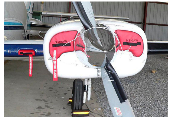
Cessna 310P Engine Inlet and Center Section Inlet Plugs