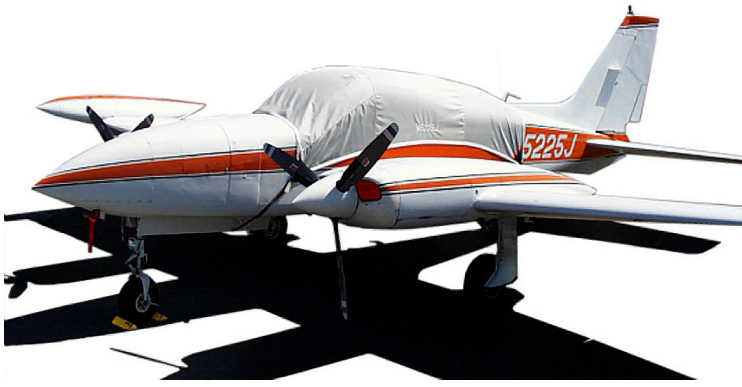
Cessna 310Q Canopy Cover