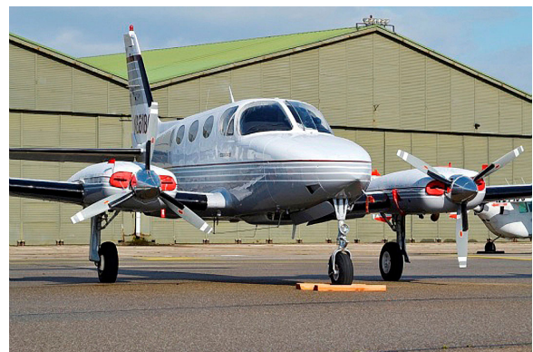
Cessna 340 Engine Plugs