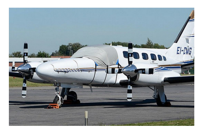
Cessna 441 Cockpit Cover