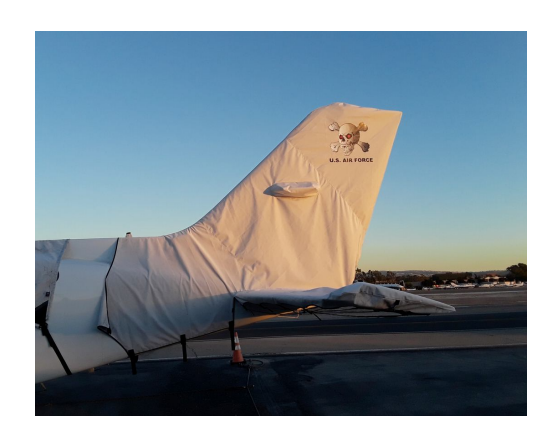
Cessna 421 Empennage Cover