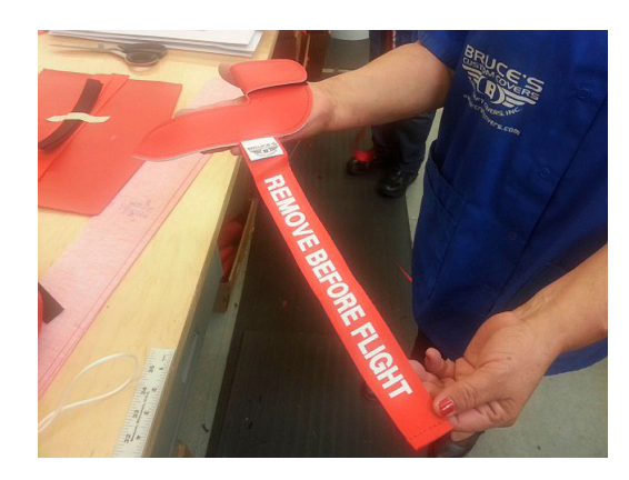
Cessna 150 Pitot Cover

Engine Inlet Plugs are custom fit for your Cessna T303 Crusader intakes, made with heavy-duty vinyl material, and stuffed with a single block of sculpted urethane foam. Each plug has a zipper that allows the foam to be removed and dried if necessary. Engine plugs have warning flags that are visible from the cockpit or 'remove before flight' streamers sewn onto the face of the plugs. Most plugs are imprinted with the aircraft registration number in black for an extra charge. Storage bag NOT included. Engine plugs may be inserted after flight when the engine is still warm. Engine Inlet Plugs are commonly referred to as Cowl Plugs, Intake Plugs, Cowl Blocks, Engine Blocks, and Engine Bungs.