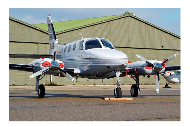
Cessna 340 Engine Plugs