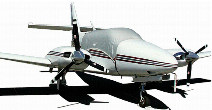
Cessna 303 Crusader Canopy Cover