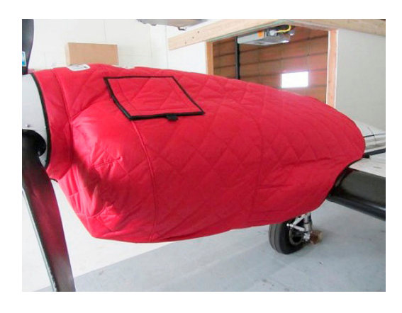
Cessna 421 Insulated Engine Covers