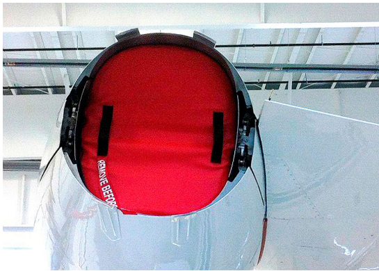
Falcon 2000EX Exhaust Plug

The Engine Inlet Plugs are custom fit for your Falcon Jet 2000EX, 2000LXS intakes, made with heavy-duty vinyl material, and stuffed with a single block of sculpted urethane foam. Each plug has a zipper that allows the foam to be removed and dried if necessary. Engine plugs have 'remove before flight' streamers sewn onto the face of the plugs. Most plugs are imprinted with the aircraft registration number in black for an extra charge. Storage bag NOT included. Engine plugs may be inserted after flight when the engine is still warm. Engine Inlet Plugs are commonly referred to as Cowl Plugs, Intake Plugs, Cowl Blocks, Engine Blocks, and Engine Bungs.