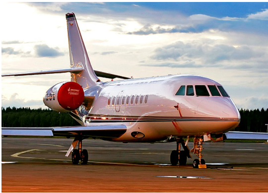
Falcon 2000EX Engine Covers, OEM type