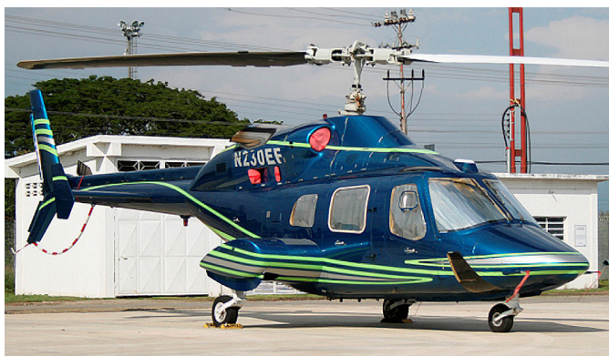
Bell 230 Engine Plugs, HeatShields

Heatshields are interior sunshades for an aircraft's windows or canopy glass. The product is a unique composite of closed-cell foam with a silver mylar finish. The semi-rigid design is stiff enough to stand along the inside of the windshield using sun visors or window framing. It folds up flat and easily stores in the included storage sleeve. Some designs may require velcro and suction cups. A Heatshield is an excellent short-term remedy for cockpit overheating.