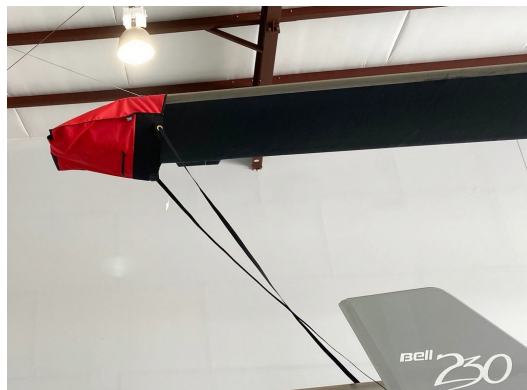
Bell 230 Blade Tie-Downs, (Semi-Rigid) W/Telescoping Attachment Handle