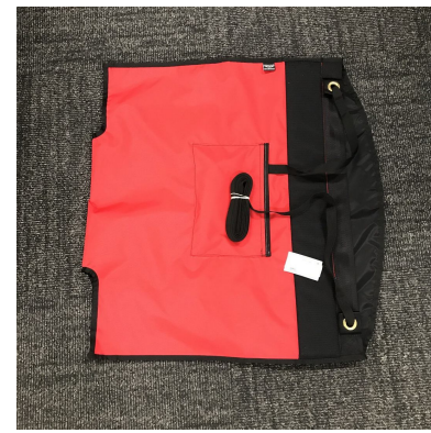
Bell 230 Blade Tie-Downs, (Semi-Rigid) W/Telescoping Attachment Handle