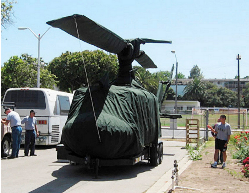
Bell 204/205 Full Body Cover Set

This cover type is made from Silver Acrylic Sunbrella canvas and is 100% lined with a soft and smooth microfiber. Bruce's Custom Covers developed this material combination especially for aircraft protection. The outer material is medium weight and treated for water resistance, UV resistance and anti-static buildup. The inner lining is a very soft and smooth microfiber to prevent scratching. The material is very reflective, and tests show that the cabin interior temperature can be reduced to near-ambient temperature on the hottest of days. It is water, ice and snow repellent, yet breathable to allow moisture to escape from between the cover and the aircraft surface.