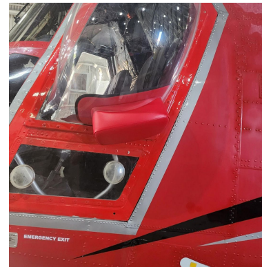
Boeing Vertol CH-47 Logger Window Plug