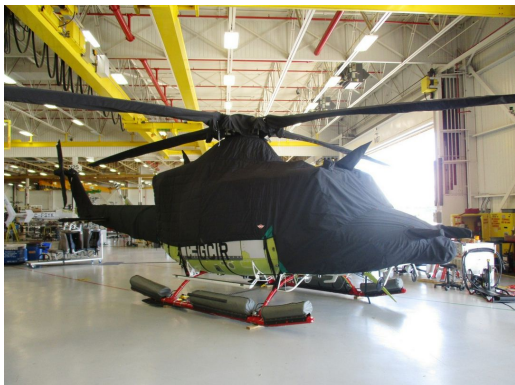
Bell 412 Cockpit/Canopy/Nose, Insulated Engine Area, Rotor Hub, Blade, Tailboom and Tail Rotor Covers

available separately. Specific information for each model is available on request.