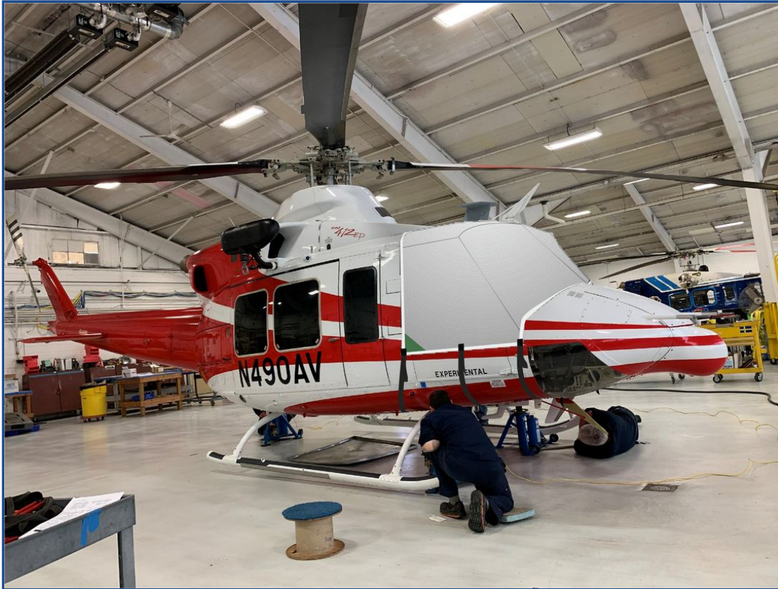
Bell 412 Cockpit/Canopy Cover, photo/illustration