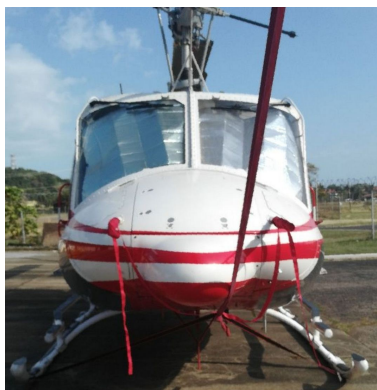
Bell 212 Windshield HeatShields

Cockpit Heatshields are interior sunshades for the aircraft's cockpit. The product is a unique composite of closed-cell foam with a silver mylar finish. The semi-rigid design is stiff enough to stand inside the window framing. Darts and folds are incorporated into the material so that it conforms to the complex shape of the helicopter windows. The set folds up flat and is easily stored in the included storage sleeve. Some designs may require velcro and suction cups. A Heatshield is an excellent short-term remedy for cockpit overheating, but an external fabric cover is more effective for long-term protection.