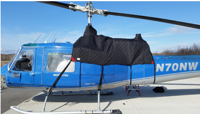
Bell 204 Insulated Engine Area Cover

WINTER USE MATERIAL - Made with Solution-Dyed Polyester fabric, this option is intended for seasonal use to aid in deicing, rain mitigation, or for occasional travel. The material is lighter and more compact, but more susceptible to UV damage and may have a shorter useful life if used continuously outside than the all-year use material.