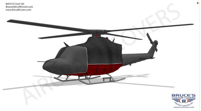
Bell 412 Forward Cabin/Nose, Insulated Engine, Tailboom, Rotor Hub & Blade Covers