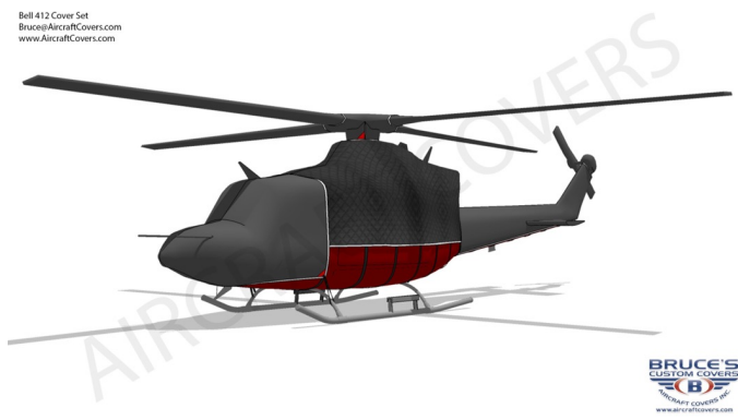
Bell 412 Forward Cabin/Nose, Insulated Engine, Tailboom, Rotor Hub & Blade Covers