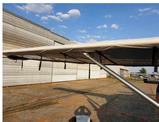
Cessna 207 Wing Covers