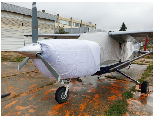
Cessna 207 Engine Cover (test fit)

This cover type is made from Silver Acrylic Sunbrella canvas and is 100% lined with a soft and smooth microfiber. Bruce's Custom Covers developed this material combination especially for aircraft protection. The outer material is medium weight and treated for water resistance, UV resistance and anti-static buildup. The inner lining is a very soft and smooth microfiber to prevent scratching. The material is very reflective, and tests show that the cabin interior temperature can be reduced to near-ambient temperature on the hottest of days. It is water, ice and snow repellent, yet breathable to allow moisture to escape from between the cover and the aircraft surface.