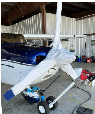
Cessna 182 Skylane 3-Blade Prop Cover