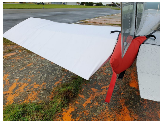
Cessna 207 Tailcone Cover, Horizontal Stab. Cover (test fit)