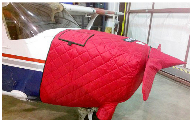
Cessna 172 Insulated Engine Cover w/ Oil Filler Door flap and Insulated Prop/Spinner Cover