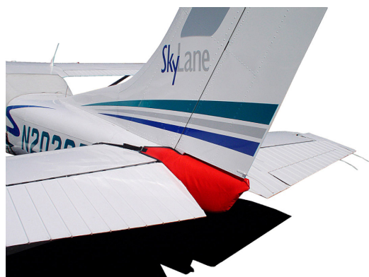
Cessna 182 Tailcone Cover

WINTER USE MATERIAL - Made with Solution-Dyed Polyester fabric, this option is intended for seasonal use to aid in deicing, rain mitigation, or for occasional travel. The material is lighter and more compact, but more susceptible to UV damage and may have a shorter useful life if used continuously outside than the all-year use material.