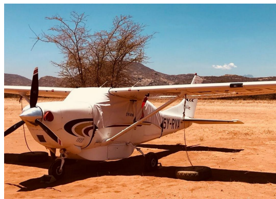
Cessna 206 Canopy Cover