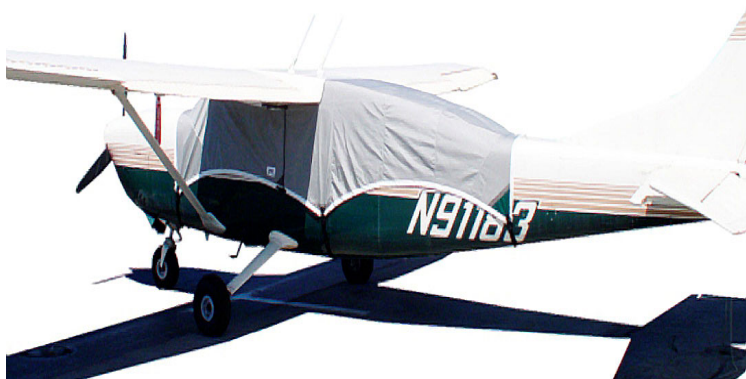
Cessna 207 Canopy Cover

This cover type is made from Silver Acrylic Sunbrella canvas and is 100% lined with a soft and smooth microfiber. Bruce's Custom Covers developed this material combination especially for aircraft protection. The outer material is medium weight and treated for water resistance, UV resistance and anti-static buildup. The inner lining is a very soft and smooth microfiber to prevent scratching. The material is very reflective, and tests show that the cabin interior temperature can be reduced to near-ambient temperature on the hottest of days. It is water, ice and snow repellent, yet breathable to allow moisture to escape from between the cover and the aircraft surface.