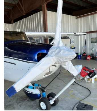
Cessna 182 Skylane 3-Blade Prop Cover