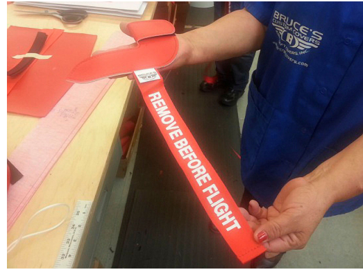
Cessna 150 Pitot Cover