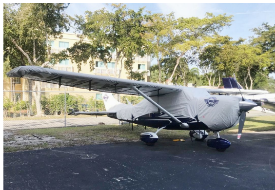
Cessna T206H Canopy, Engine, Wing & Empennage Covers