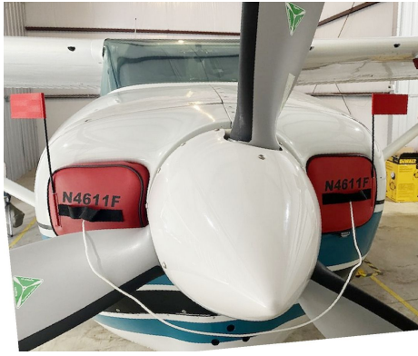
Cessna P206A Engine Plugs

be inserted after flight when the engine is still warm. Engine Inlet Plugs are commonly referred to as Cowl Plugs, Intake Plugs, Cowl Blocks, Engine Blocks, and Engine Bungs.