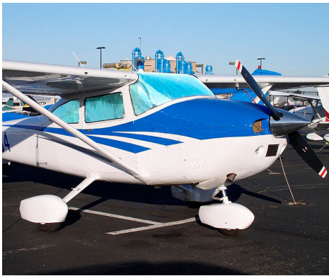
Cessna 182 HeatShield Set

Windshield Heatshields are interior sunshades for an aircraft's front windshield. The product is a unique composite of closed-cell foam with a silver mylar finish. The semi-rigid design is stiff enough to stand along the inside of the windshield using sun visors or window framing. It folds up flat and easily stores in the included storage sleeve. Some designs may require velcro and suction cups or split right and left sides. A Heatshield is an excellent short-term remedy for cockpit overheating. An external fabric cover is far more effective and practical for long-term protection.