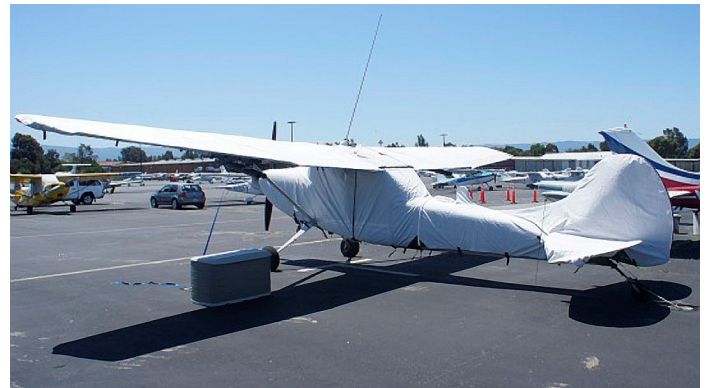
Wing Covers on Cessna Bird Dog