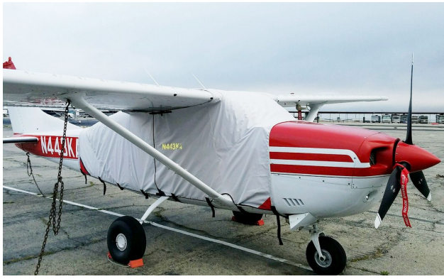
Cessna 206 Over-Top, Extended Canopy Cover