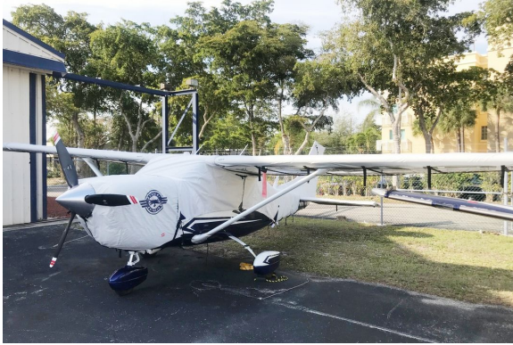
Cessna T206H Canopy, Engine, Wing & Empennage Covers

This cover type is made from Silver Acrylic Sunbrella canvas and is 100% lined with a soft and smooth microfiber. Bruce's Custom Covers developed this material combination especially for aircraft protection. The outer material is medium weight and treated for water resistance, UV resistance and anti-static buildup. The inner lining is a very soft and smooth microfiber to prevent scratching. The material is very reflective, and tests show that the cabin interior temperature can be reduced to near-ambient temperature on the hottest of days. It is water, ice and snow repellent, yet breathable to allow moisture to escape from between the cover and the aircraft surface.