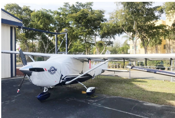
Cessna T206H Canopy, Engine, Wing & Empennage Covers