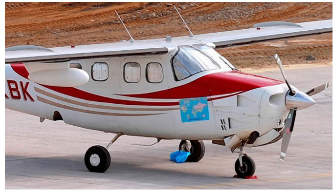
Cessna P210 HeatShield Set