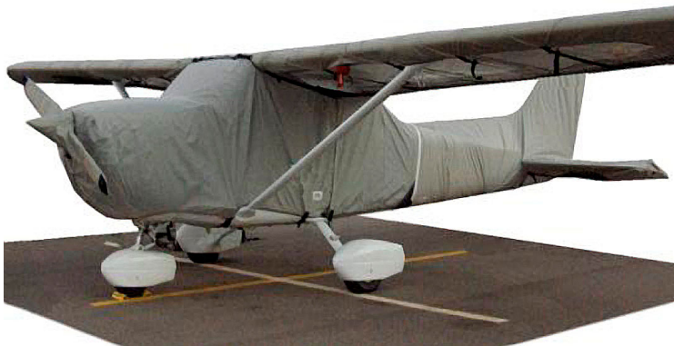
Cessna 172 Propellor Cover, 2 Blade

WINTER USE MATERIAL - Made with Solution-Dyed Polyester fabric, this option is intended for seasonal use to aid in deicing, rain mitigation, or for occasional travel. The material is lighter and more compact, but more susceptible to UV damage and may have a shorter useful life if used continuously outside than the all-year use material.