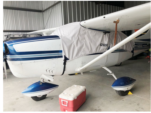
Cessna 206 Wrap-Around Canopy Cover