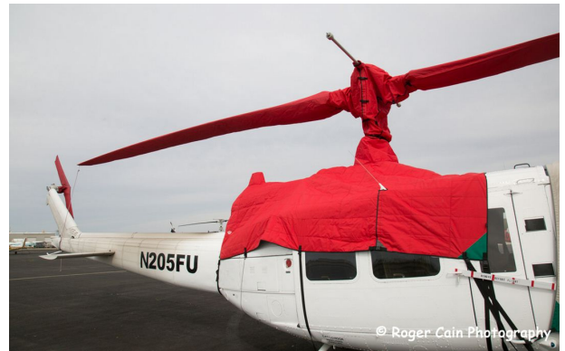
Bell 205 Engine, Rotor Mast & Blades Covers