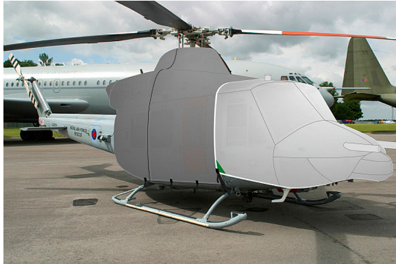
Forward Cabin Nose & Mid-Cabin/Engine Cover (extended to cross tubes)

This cover type is made from Silver Acrylic Sunbrella canvas and is 100% lined with a soft and smooth microfiber. Bruce's Custom Covers developed this material combination especially for aircraft protection. The outer material is medium weight and treated for water resistance, UV resistance and anti-static buildup. The inner lining is a very soft and smooth microfiber to prevent scratching. The material is very reflective, and tests show that the cabin interior temperature can be reduced to near-ambient temperature on the hottest of days. It is water, ice and snow repellent, yet breathable to allow moisture to escape from between the cover and the aircraft surface.