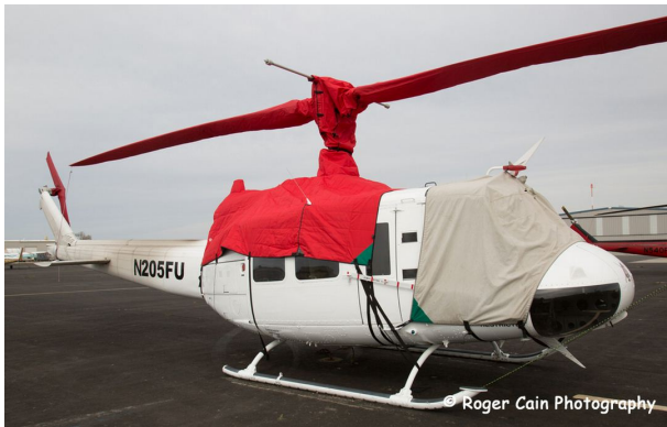
Bell 205 Engine, Rotor Mast, Blades & Forward Cabin Covers

WINTER USE MATERIAL - Made with Solution-Dyed Polyester fabric, this option is intended for seasonal use to aid in deicing, rain mitigation, or for occasional travel. The material is lighter and more compact, but more susceptible to UV damage and may have a shorter useful life if used continuously outside than the all-year use material.