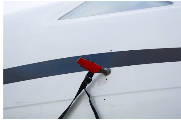
Falcon Jet 2000 Pitot Covers, Aoa's, Tat Cover Set, Heat Resistant Type