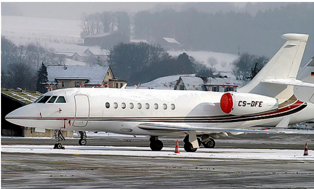
Engine Intake Cover Set, Pitot Cover Set

The Falcon Jet 2000 Intake Covers are designed to install easily yet be completely storable. A spring steel hoop is sewn into the hem of each cover, allowing them to be installed without climbing onto the wing or using a stepladder. To store the covers the spring steel hoop folds like a band-saw blade into three nesting rings. Each cover folds into a compact circular bundle which is stored in the included duffle bag, yet they unfold quickly for use. The Tri-Fold Ring cover is made of medium weight nylon which is available in a variety of colors to match the paint trim. Each cover set comes complete with installation and folding instructions. The aircraft's registration number can be silkscreened onto the cover for an extra charge.