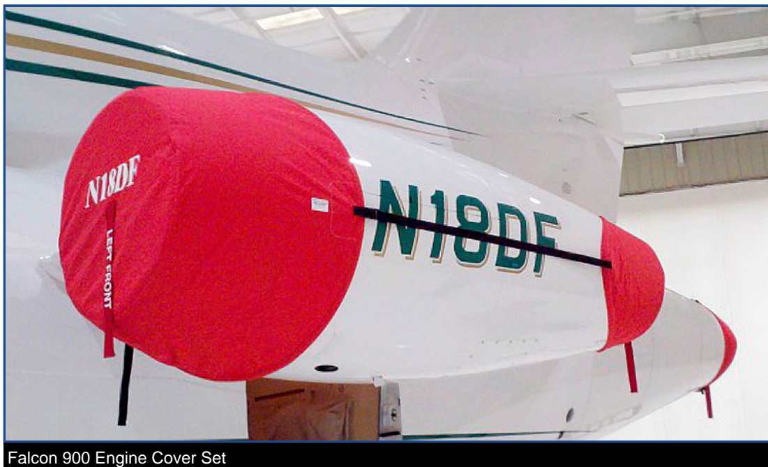
Falcon 900 Engine Cover Set