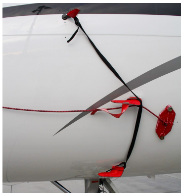
Falcon Jet 2000 Pitot Covers, Aoa's, Tat Cover Set, Heat Resistant Type