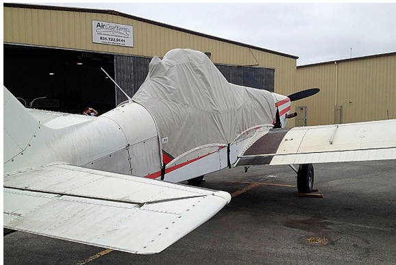
Piper Brave PA-36 Canopy/Hopper Cover

water resistance, UV resistance and anti-static buildup. The inner lining is a very soft and smooth microfiber to prevent scratching. The material is very reflective, and tests show that the cabin interior temperature can be reduced to near-ambient temperature on the hottest of days. It is water, ice and snow repellent, yet breathable to allow moisture to escape from between the cover and the aircraft surface.