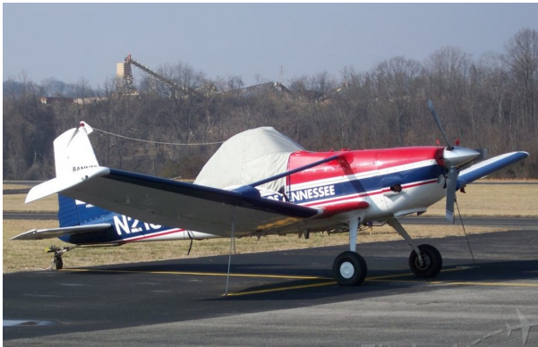
Cessna 188 Ag Truck Canopy Cover

Travel Covers are made with Silver Solution-Dyed Polyester fabric and only lined over the windshield to save weight. The material is lightweight and more compact for easy stowage in the aircraft. The polyester material is water resistant, but only intended for occasional use outside. We also have an ultra lightweight material available for fitted hangar dust covers. For daily outdoor use, the non-travel Sunbrella Cover is the best choice.