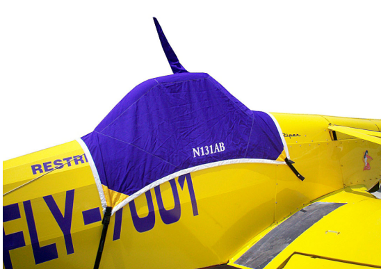
Piper Pawnee Canopy Cover