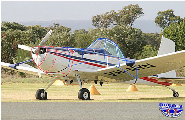
Cessna Ag Truck Canopy/Hopper and Engine Covers (illustration)

This cover type is made from Silver Acrylic Sunbrella canvas and is 100% lined with a soft and smooth microfiber. Bruce's Custom Covers developed this material combination especially for aircraft protection. The outer material is medium weight and treated for water resistance, UV resistance and anti-static buildup. The inner lining is a very soft and smooth microfiber to prevent scratching. The material is very reflective, and tests show that the cabin interior temperature can be reduced to near-ambient temperature on the hottest of days. It is water, ice and snow repellent, yet breathable to allow moisture to escape from between the cover and the aircraft surface.