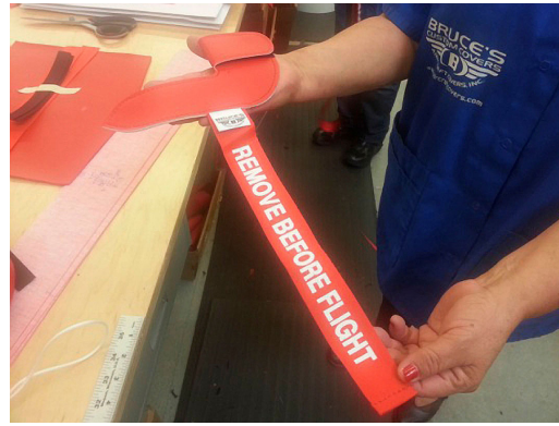
Cessna 150 Pitot Cover