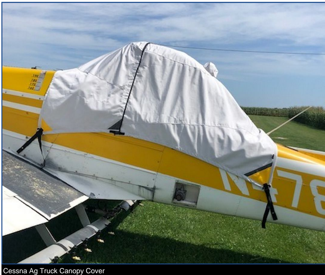
Cessna Ag Truck Canopy Cover