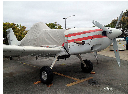
Piper Brave PA-36 Canopy/Hopper Cover