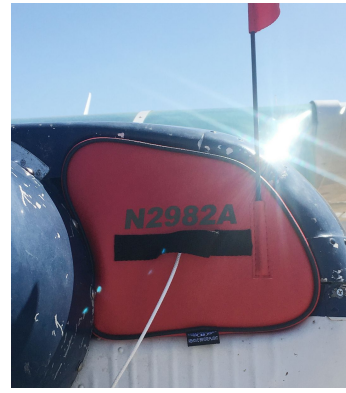
Cessna 180/185 Skywagon Engine Inlet Plugs