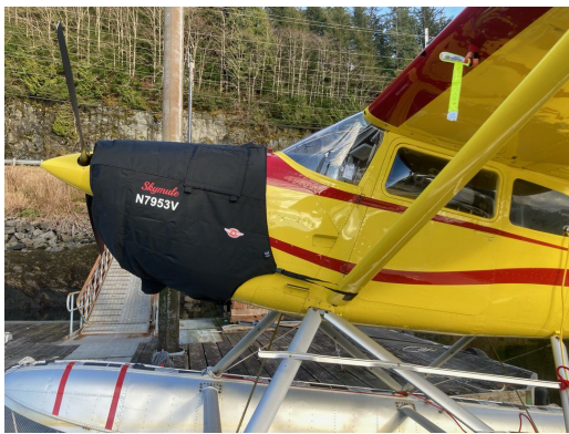
Cessna 180H Skywagon Insulated Engine Cover, Fully Enclosed