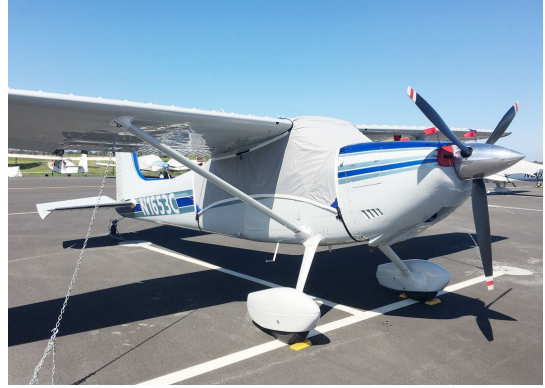
Cessna 180 Travel Weight Canopy Cover, Engine Plugs