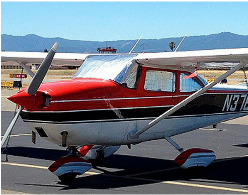
Cessna 172 Cabin HeatShields

Windshield Heatshields are interior sunshades for an aircraft's front windshield. The product is a unique composite of closed-cell foam with a silver mylar finish. The semi-rigid design is stiff enough to stand along the inside of the windshield using sun visors or window framing. It folds up flat and easily stores in the included storage sleeve. Some designs may require velcro and suction cups or split right and left sides. A Heatshield is an excellent short-term remedy for cockpit overheating. An external fabric cover is far more effective and practical for long-term protection.