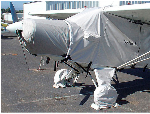
Piper PA-12 Landing Gear Covers