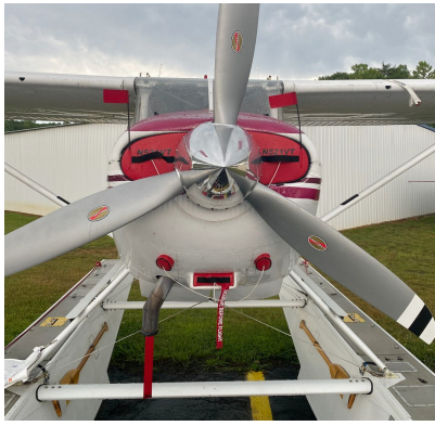
Cessna 180A Engine Plugs