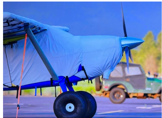
Cessna 185 Canopy, Wing & Engine Covers