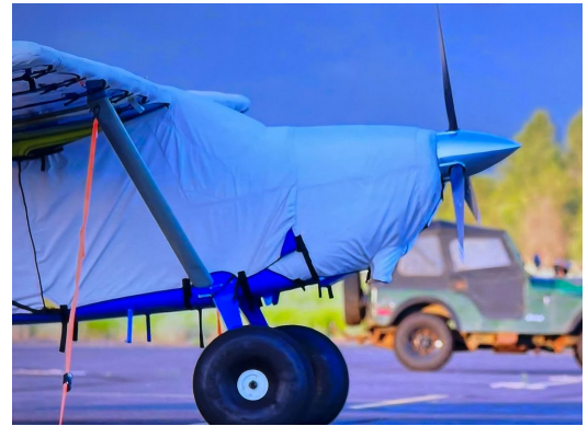
Cessna 185 Canopy, Wing & Engine Covers