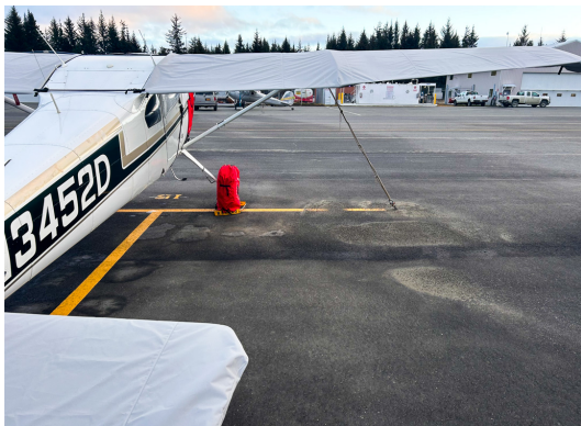
Cessna 180/185 Skywagon Windshield Cover

This cover type is made from Silver Acrylic Sunbrella canvas and is 100% lined with a soft and smooth microfiber. Bruce's Custom Covers developed this material combination especially for aircraft protection. The outer material is medium weight and treated for water resistance, UV resistance and anti-static buildup. The inner lining is a very soft and smooth microfiber to prevent scratching. The material is very reflective, and tests show that the cabin interior temperature can be reduced to near-ambient temperature on the hottest of days. It is water, ice and snow repellent, yet breathable to allow moisture to escape from between the cover and the aircraft surface.