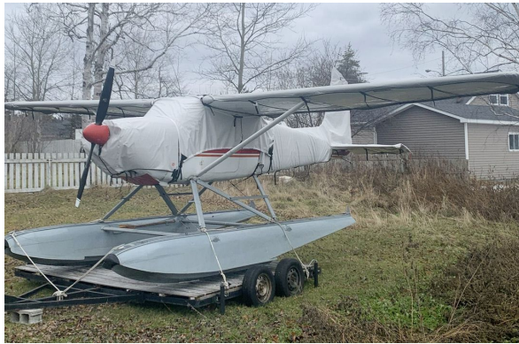
Cessna 180A Canopy, Engine, Wing & Empennage Covers

WINTER USE MATERIAL - Made with Solution-Dyed Polyester fabric, this option is intended for seasonal use to aid in deicing, rain mitigation, or for occasional travel. The material is lighter and more compact, but more susceptible to UV damage and may have a shorter useful life if used continuously outside than the all-year use material.