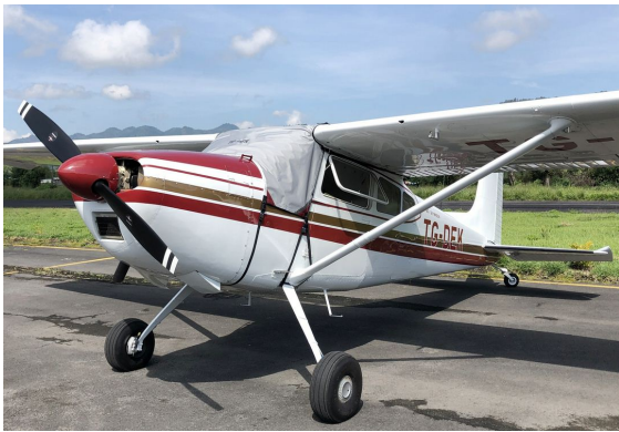
Cessna 180 Windshield Cover

This cover type is made from Silver Acrylic Sunbrella canvas and is 100% lined with a soft and smooth microfiber. Bruce's Custom Covers developed this material combination especially for aircraft protection. The outer material is medium weight and treated for water resistance, UV resistance and anti-static buildup. The inner lining is a very soft and smooth microfiber to prevent scratching. The material is very reflective, and tests show that the cabin interior temperature can be reduced to near-ambient temperature on the hottest of days. It is water, ice and snow repellent, yet breathable to allow moisture to escape from between the cover and the aircraft surface.