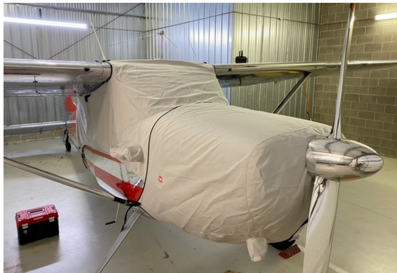
Cessna 170 Engine & Canopy Covers

This cover type is made from Silver Acrylic Sunbrella canvas and is 100% lined with a soft and smooth microfiber. Bruce's Custom Covers developed this material combination especially for aircraft protection. The outer material is medium weight and treated for water resistance, UV resistance and anti-static buildup. The inner lining is a very soft and smooth microfiber to prevent scratching. The material is very reflective, and tests show that the cabin interior temperature can be reduced to near-ambient temperature on the hottest of days. It is water, ice and snow repellent, yet breathable to allow moisture to escape from between the cover and the aircraft surface.