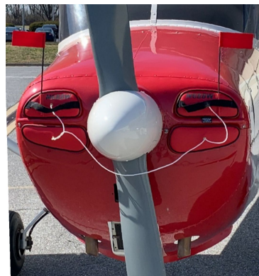
Cessna 170 Engine Plugs