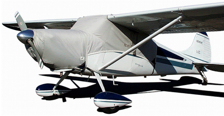
Cessna 170 Canopy Cover & Engine Cover