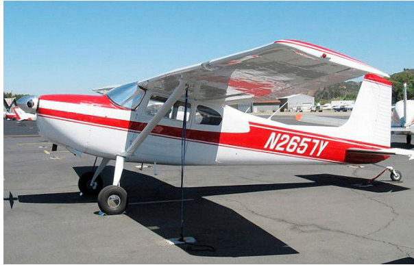
Cessna 180 & 185 Windshield HeatShield

Windshield Heatshields are interior sunshades for an aircraft's front windshield. The product is a unique composite of closed-cell foam with a silver mylar finish. The semi-rigid design is stiff enough to stand along the inside of the windshield using sun visors or window framing. It folds up flat and easily stores in the included storage sleeve. Some designs may require velcro and suction cups or split right and left sides. A Heatshield is an excellent short-term remedy for cockpit overheating. An external fabric cover is far more effective and practical for long-term protection.