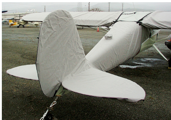
Cessna 120 Empennage Cover

WINTER USE MATERIAL - Made with Solution-Dyed Polyester fabric, this option is intended for seasonal use to aid in deicing, rain mitigation, or for occasional travel. The material is lighter and more compact, but more susceptible to UV damage and may have a shorter useful life if used continuously outside than the all-year use material.