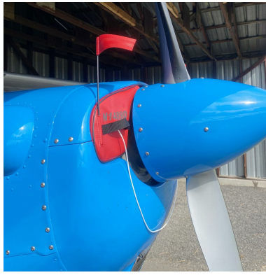
Custom Plugs for Cessna 170 with 180HP lycoming O-360 Engine