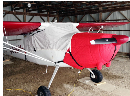
Cessna 170 Insulated Engine Cover