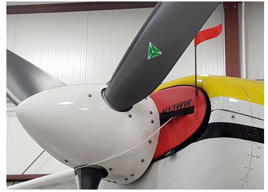
Cessna 180/185 Skywagon Engine Inlet Plugs