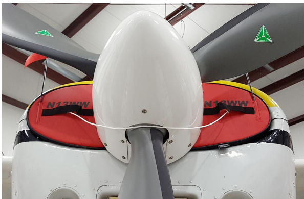
Cessna 180/185 Skywagon Engine Inlet Plugs