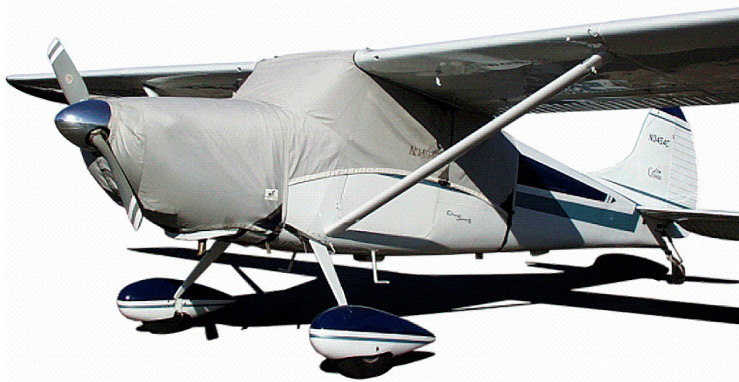
Cessna 170 Canopy Cover & Engine Cover

This cover type is made from Silver Acrylic Sunbrella canvas and is 100% lined with a soft and smooth microfiber. Bruce's Custom Covers developed this material combination especially for aircraft protection. The outer material is medium weight and treated for water resistance, UV resistance and anti-static buildup. The inner lining is a very soft and smooth microfiber to prevent scratching. The material is very reflective, and tests show that the cabin interior temperature can be reduced to near-ambient temperature on the hottest of days. It is water, ice and snow repellent, yet breathable to allow moisture to escape from between the cover and the aircraft surface.