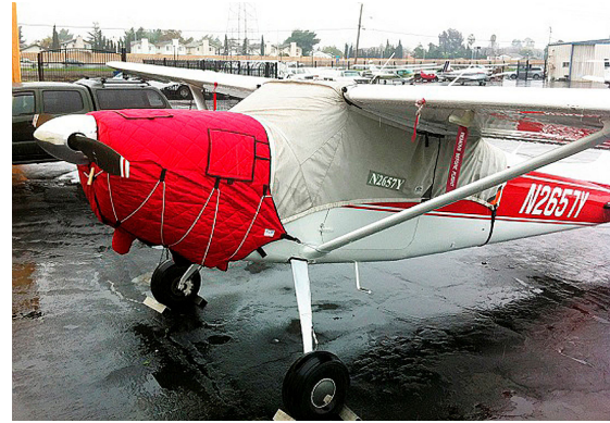
Cessna 180 Insulated Engine Cover