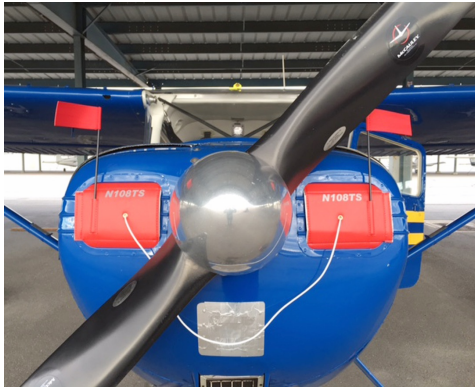
Cessna 170 Engine Inlet Covers (cards)

This cover type is made from Silver Acrylic Sunbrella canvas and is 100% lined with a soft and smooth microfiber. Bruce's Custom Covers developed this material combination especially for aircraft protection. The outer material is medium weight and treated for water resistance, UV resistance and anti-static buildup. The inner lining is a very soft and smooth microfiber to prevent scratching. The material is very reflective, and tests show that the cabin interior temperature can be reduced to near-ambient temperature on the hottest of days. It is water, ice and snow repellent, yet breathable to allow moisture to escape from between the cover and the aircraft surface.