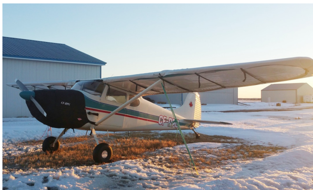
Cessna 170 Insulated Engine Cover, Wing Covers