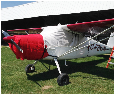
Cessna 170 Over-Top Canopy Cover, Insulated Engine Cover