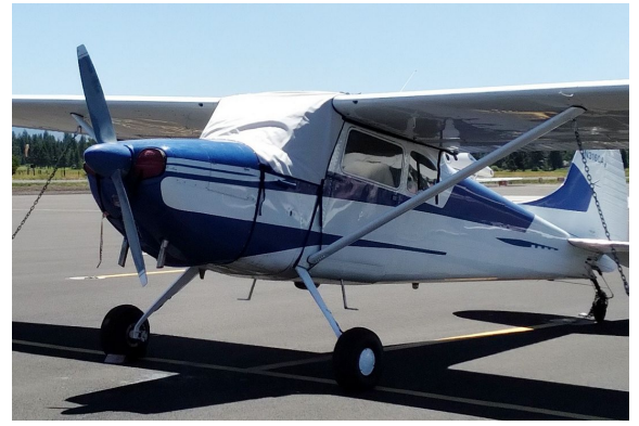
Cessna 170 Windshield Cover