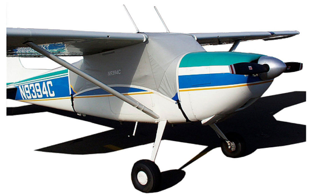
Cessna 180 Canopy Cover