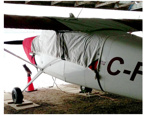
Cessna 170 Insulated Engine Cover