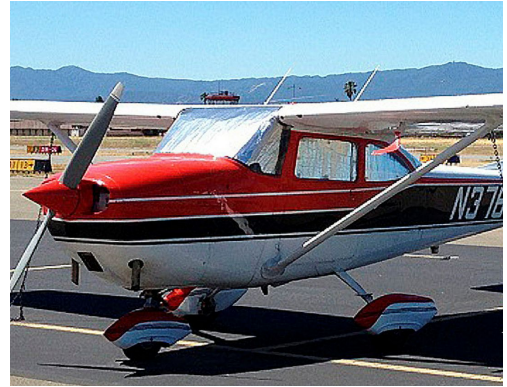
Cessna 172 Cabin HeatShields