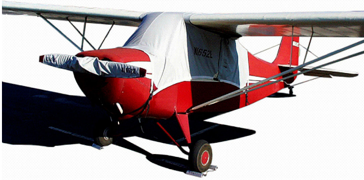
Aeronca Champ Canopy & Prop Covers

This cover type is made from Silver Acrylic Sunbrella canvas and is 100% lined with a soft and smooth microfiber. Bruce's Custom Covers developed this material combination especially for aircraft protection. The outer material is medium weight and treated for water resistance, UV resistance and anti-static buildup. The inner lining is a very soft and smooth microfiber to prevent scratching. The material is very reflective, and tests show that the cabin interior temperature can be reduced to near-ambient temperature on the hottest of days. It is water, ice and snow repellent, yet breathable to allow moisture to escape from between the cover and the aircraft surface.