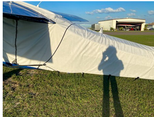
Aeronca Sedan Empennage Cover (Tailboom, Vertical & Horiz Stabilizers), All Year Use