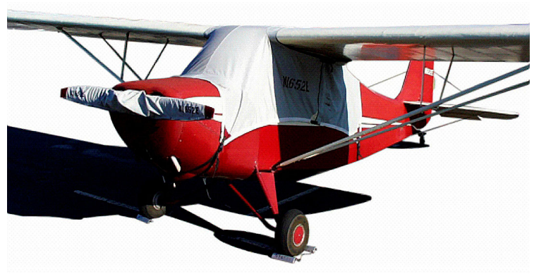
Aeronca Champ Canopy & Prop Covers