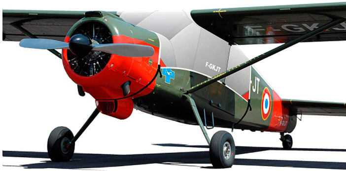
Broussard Canopy Cover (illustration)