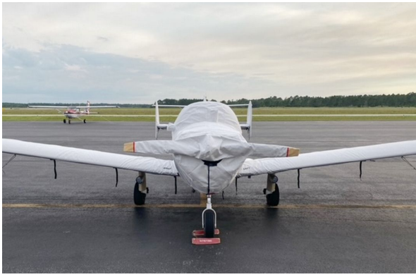
Ercoupe Complete Cover Set