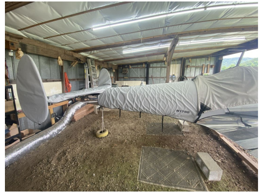
Ercoupe Empennage Cover