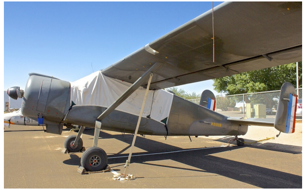
Broussard Canopy Cover