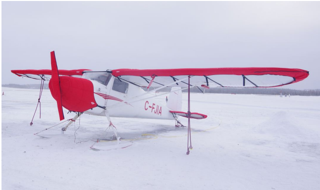
Cessna 120 Insulated Engine & Prop Covers, Wing & Tail Covers

WINTER USE MATERIAL - Made with Solution-Dyed Polyester fabric, this option is intended for seasonal use to aid in deicing, rain mitigation, or for occasional travel. The material is lighter and more compact, but more susceptible to UV damage and may have a shorter useful life if used continuously outside than the all-year use material.