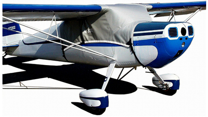
Cessna 120 Over-Top Canopy Cover