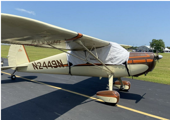
Cessna 140 Over-Top Canopy Cover

This cover type is made from Silver Acrylic Sunbrella canvas and is 100% lined with a soft and smooth microfiber. Bruce's Custom Covers developed this material combination especially for aircraft protection. The outer material is medium weight and treated for water resistance, UV resistance and anti-static buildup. The inner lining is a very soft and smooth microfiber to prevent scratching. The material is very reflective, and tests show that the cabin interior temperature can be reduced to near-ambient temperature on the hottest of days. It is water, ice and snow repellent, yet breathable to allow moisture to escape from between the cover and the aircraft surface.