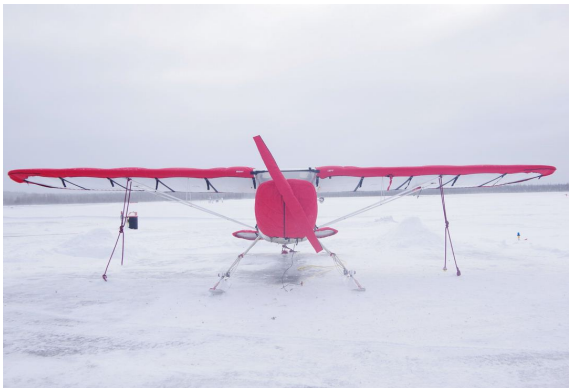
Cessna 120 Insulated Engine & Prop Covers, Wing & Tail Covers

This cover type is made from Silver Acrylic Sunbrella canvas and is 100% lined with a soft and smooth microfiber. Bruce's Custom Covers developed this material combination especially for aircraft protection. The outer material is medium weight and treated for water resistance, UV resistance and anti-static buildup. The inner lining is a very soft and smooth microfiber to prevent scratching. The material is very reflective, and tests show that the cabin interior temperature can be reduced to near-ambient temperature on the hottest of days. It is water, ice and snow repellent, yet breathable to allow moisture to escape from between the cover and the aircraft surface.