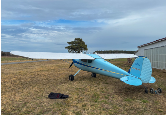
Cessna 140 Wing Covers, All Year Use, specify fabric wings (set of 2)

WINTER USE MATERIAL - Made with Solution-Dyed Polyester fabric, this option is intended for seasonal use to aid in deicing, rain mitigation, or for occasional travel. The material is lighter and more compact, but more susceptible to UV damage and may have a shorter useful life if used continuously outside than the all-year use material.