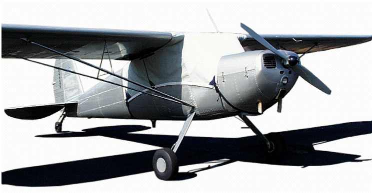
Cessna 120 Over-Top Canopy Cover