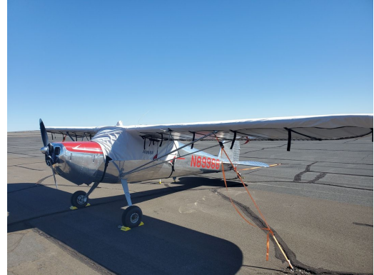
Cessna 140 Over The Top Style Canopy Cover, Wing Covers