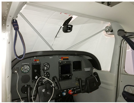
Cessna 180 Skywagon Windshield Heatshield, (W/ Compass)