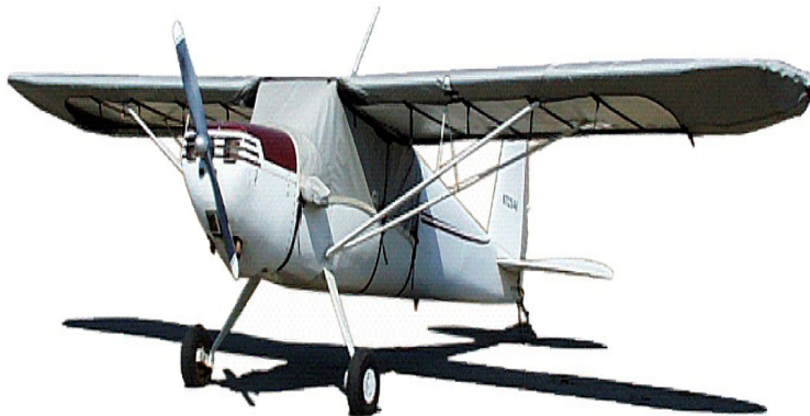
Cessna 120 Canopy Cover & Wing Covers

This cover type is made from Silver Acrylic Sunbrella canvas and is 100% lined with a soft and smooth microfiber. Bruce's Custom Covers developed this material combination especially for aircraft protection. The outer material is medium weight and treated for water resistance, UV resistance and anti-static buildup. The inner lining is a very soft and smooth microfiber to prevent scratching. The material is very reflective, and tests show that the cabin interior temperature can be reduced to near-ambient temperature on the hottest of days. It is water, ice and snow repellent, yet breathable to allow moisture to escape from between the cover and the aircraft surface.