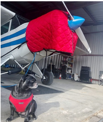
Piper PA-12 Insulated Hangar Blanket