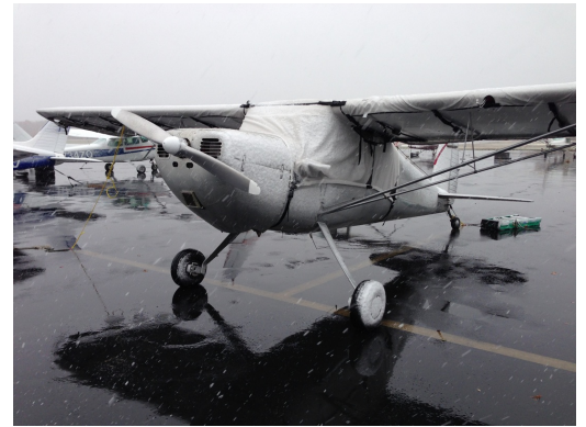
Cessna 120/140 Canopy and Wing Covers