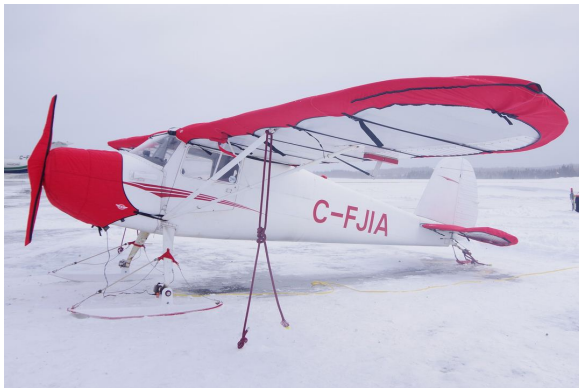
Cessna 120 Insulated Engine & Prop Covers, Wing & Tail Covers

This cover type is made from Silver Acrylic Sunbrella canvas and is 100% lined with a soft and smooth microfiber. Bruce's Custom Covers developed this material combination especially for aircraft protection. The outer material is medium weight and treated for water resistance, UV resistance and anti-static buildup. The inner lining is a very soft and smooth microfiber to prevent scratching. The material is very reflective, and tests show that the cabin interior temperature can be reduced to near-ambient temperature on the hottest of days. It is water, ice and snow repellent, yet breathable to allow moisture to escape from between the cover and the aircraft surface.