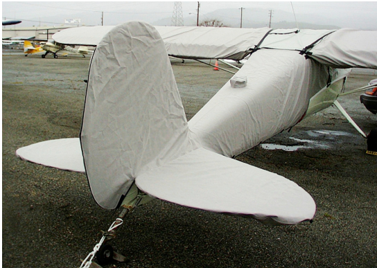
Cessna 120 Empennage & Wing Covers