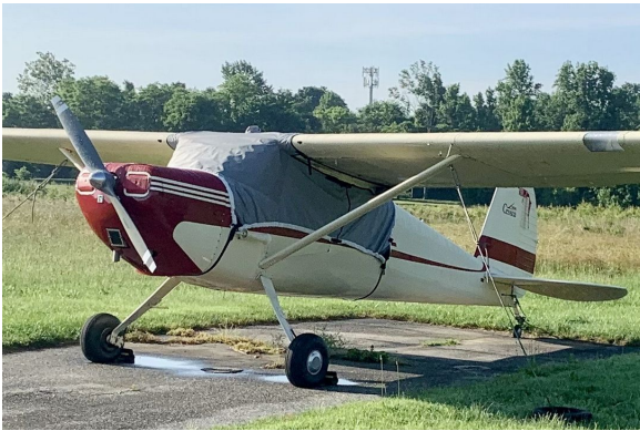
Cessna 140 Travel Weight Canopy Cover