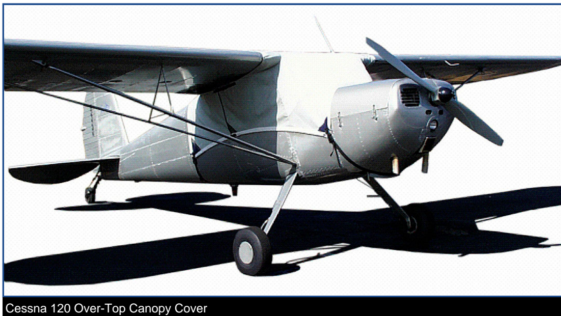
Cessna 120 Over-Top Canopy Cover