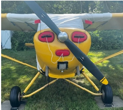
Aeronca 11CC Super Chief Engine Plugs, Extended Canopy Cover (also covers gas caps)

Engine Inlet Plugs are custom fit for your Aeronca Chief 11AC, Super Chief 11CC intakes, made with heavy-duty vinyl material, and stuffed with a single block of sculpted urethane foam. Each plug has a zipper that allows the foam to be removed and dried if necessary. Engine plugs have warning flags that are visible from the cockpit or 'remove before flight' streamers sewn onto the face of the plugs. Most plugs are imprinted with the aircraft registration number in black for an extra charge. Storage bag NOT included. Engine plugs may be inserted after flight when the engine is still warm. Engine Inlet Plugs are commonly referred to as Cowl Plugs, Intake Plugs, Cowl Blocks, Engine Blocks, and Engine Bungs.