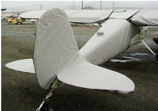
Cessna 120 Empennage Cover

WINTER USE MATERIAL - Made with Solution-Dyed Polyester fabric, this option is intended for seasonal use to aid in deicing, rain mitigation, or for occasional travel. The material is lighter and more compact, but more susceptible to UV damage and may have a shorter useful life if used continuously outside than the all-year use material.