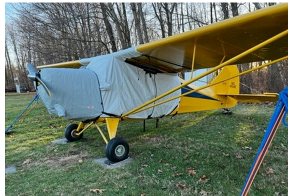
Aeronca Chief 11AC, Super Chief 11CC Insulated Engine Cover