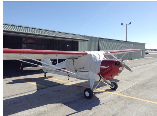
Aeronca Chief Canopy Cover