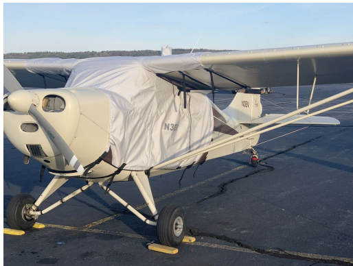
Aeronca Chief 11BC Extended Over-Top Canopy Cover

This cover type is made from Silver Acrylic Sunbrella canvas and is 100% lined with a soft and smooth microfiber. Bruce's Custom Covers developed this material combination especially for aircraft protection. The outer material is medium weight and treated for water resistance, UV resistance and anti-static buildup. The inner lining is a very soft and smooth microfiber to prevent scratching. The material is very reflective, and tests show that the cabin interior temperature can be reduced to near-ambient temperature on the hottest of days. It is water, ice and snow repellent, yet breathable to allow moisture to escape from between the cover and the aircraft surface.