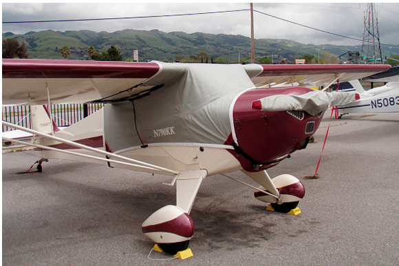
Taylorcraft Over-Top Canopy Cover

This cover type is made from Silver Acrylic Sunbrella canvas and is 100% lined with a soft and smooth microfiber. Bruce's Custom Covers developed this material combination especially for aircraft protection. The outer material is medium weight and treated for water resistance, UV resistance and anti-static buildup. The inner lining is a very soft and smooth microfiber to prevent scratching. The material is very reflective, and tests show that the cabin interior temperature can be reduced to near-ambient temperature on the hottest of days. It is water, ice and snow repellent, yet breathable to allow moisture to escape from between the cover and the aircraft surface.