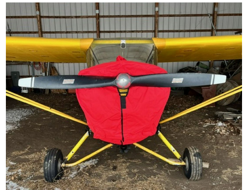
Aeronca 11AC Chief Insulated Engine Cover