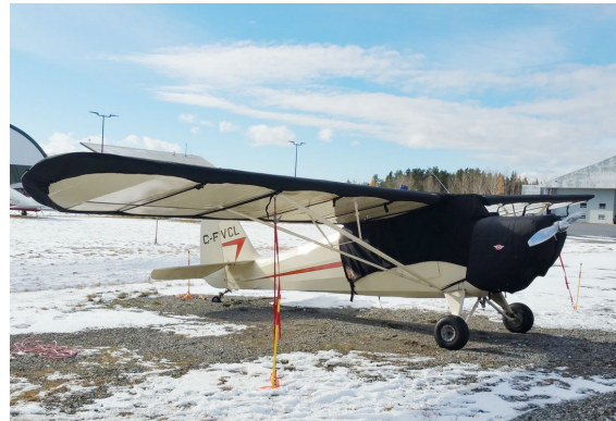
Aeronca Chief 11AC Canopy, Insulated Engine, & Wing Covers