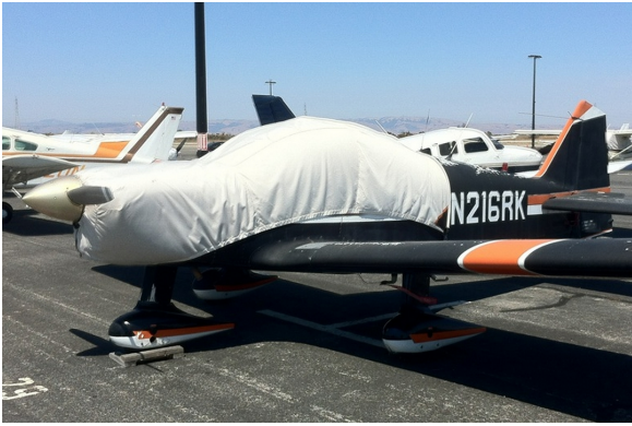
Robin Canopy/Engine Cover

the hottest of days. It is water, ice and snow repellent, yet breathable to allow moisture to escape from between the cover and the aircraft surface.