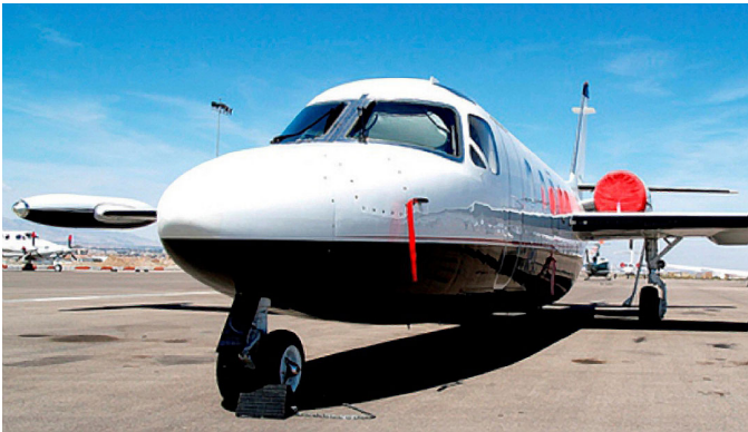
Westwind Engine Cover Set, Pitot Cover