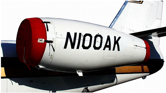
IAI Astra Engine Cover Set

instructions. The aircraft's registration number can be silkscreened onto the cover for an extra charge.